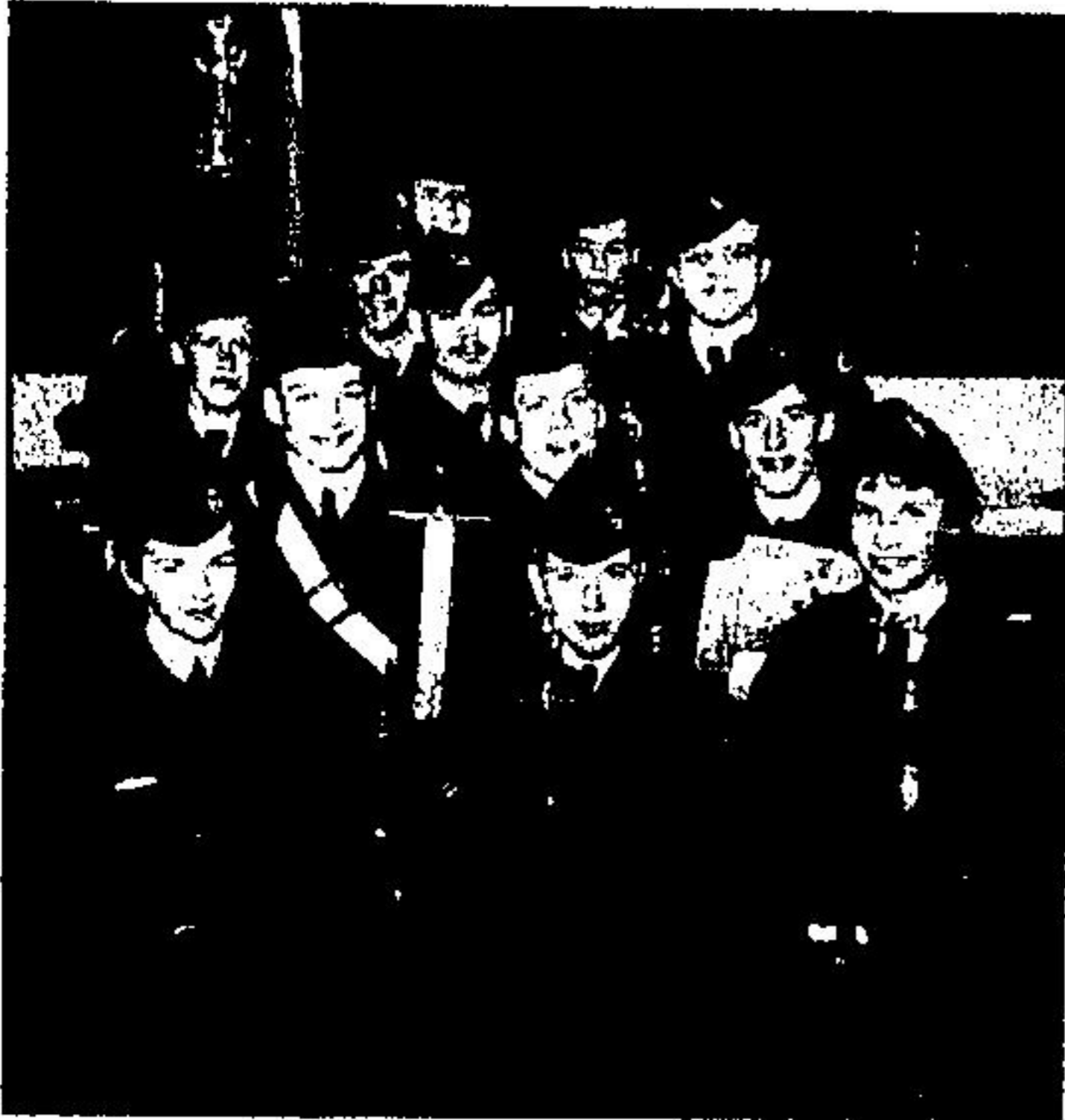
Air Cadet award winners