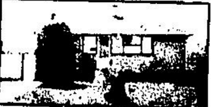
DON'T MISS THIS!!