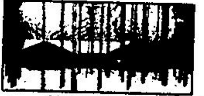
NEW AND BEAUTIFUL

7 room brick bungalow on 3 acre treed lot 20 minutes from airport. 2 car garage, sunken living room, cathedral ceilings. Call Howard Caton 877-5296. 4583