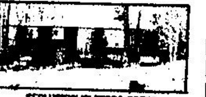
SECLUSION IN TERRA COTTA

Beautiful ravine setting backing onto conservation. Spacious 4 bedroom, huge country kitchen, main floor family room with brick fireplace, inground pool all for $128,000. Call Sue Graham or Mike Adams 877-5296. 4587