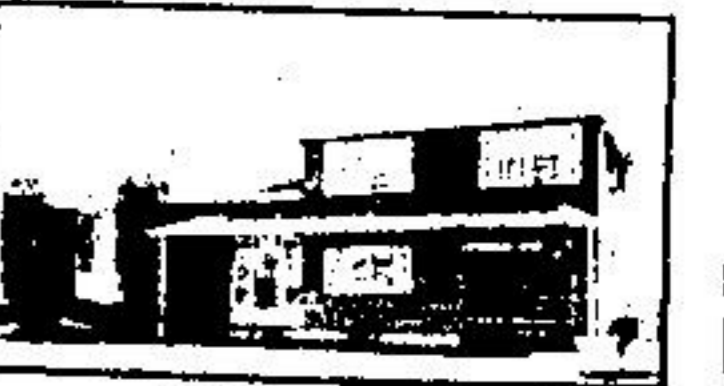
"VACATION AT HOME"

Brand new bright 4 bedroom family home with brick fireplace and walkout from family room. Lovely setting close to schools, shopping. Ask for Gerry Rotzal 877-5296. 4567