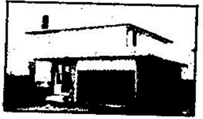
A LOT OF HOUSE

Bonus 3 bedroom bungalow. Very nicely decorated, finished basement, 2 baths. Close to schools. Call to view. Anne or Ab Genoe 877-5296. 4597