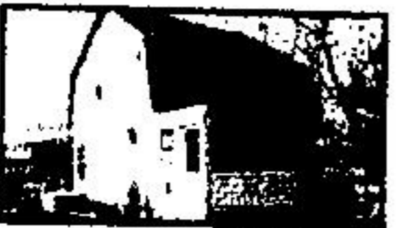
DAYS OF YOUR LIFE

Could be more enjoyable in this charming home located close to stores and lake. Asking only $57,900. For details please call Alex and Barb Glenn 877-5296 4593