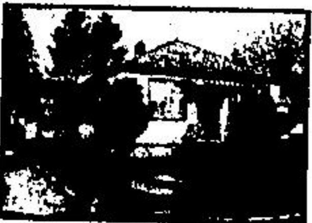
ASK THE NEIGHBOURS

Good solid 2 storey home. 4 bedrooms, large dining room, living room. New roof, siding, windows. $59,900. Call Anne or Ab Genoe 877-5296. 4600