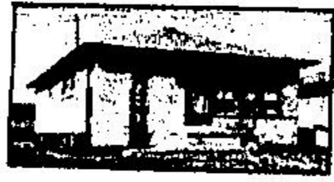
"PRICED TO SELL"

3 bedroom brick bungalow, large finished rec room with paved drive. Only $75,900 Howard Caton 877-5296. 4569