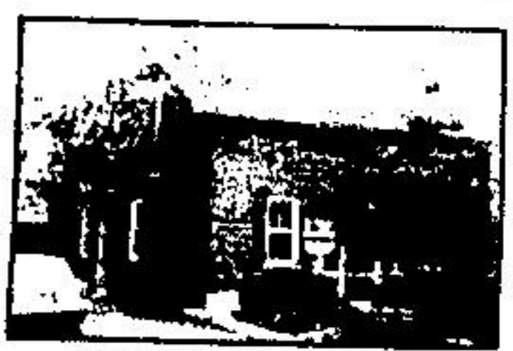
COULD THIS ONE BE FOR YOU?

3 bedrooms with fireplace in living room, plus an in law suite with fireplace downstairs, that could be used as additional living space, also has central air and central vacuum, but if you prefer the outdoors, there's also a new inground pool and built in BBQ under covered deck. Ask for Linda Nicholson 877-5296. 4609