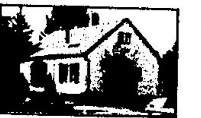
NEWLY RENOVATED LITTLE GEM!

$84,900. You must look at this one. Super bungalow on large fenced lot, loaded with extras. Anne or Ab Genoe 877-5296. 4627