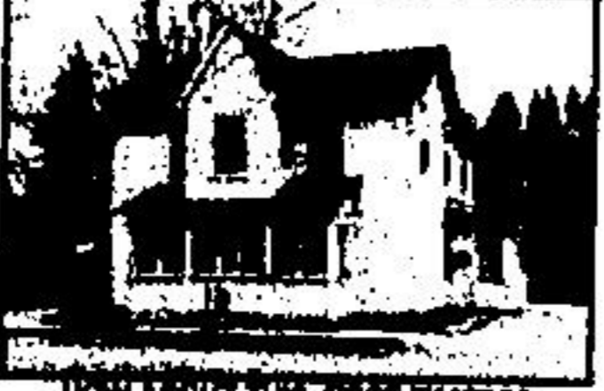
HOW ABOUT THIS FIRST TIMER?