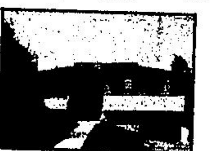
DON'T BE LEFT WISHING!

$89,900. Just arrange your furniture in this brick & vinyl 3 bedroom home backing onto open fields. Main floor family room with walkout. Single garage. Call Gerry Rotzal 877-5296. 4518