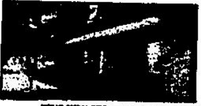
"THE NEW STONE HOME"

Truly lovely open concept with thermo skylights, and thermo picture windows overlooking pond surrounded by spruce and pine. Totally finished. Approximately 1800 sq. ft. with attached garage. Call Alex & Barb Glenn 877-5296. 4502