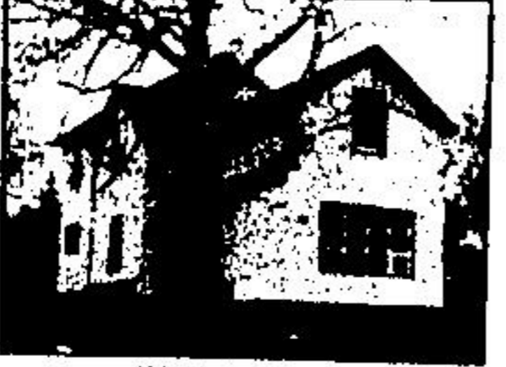
"IF YOU'RE LUCKY"

1/2 acre lot with 1 1/2 storey home, barn, detached garage. Perfect for the handyman. Call Gerry Rotzal 877-5296. 4616