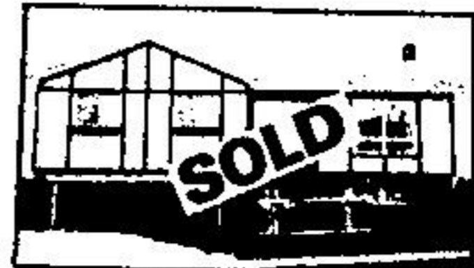
YES ONLY $78,500

Lots of privacy on 1/2 acre treed lot with cute 3 bedroom home. New oak kitchen, sliders to deck and lovely antique brick fireplace. To see this beautiful Bellouant property ask for Linda Nicholson 877-5296. 4617