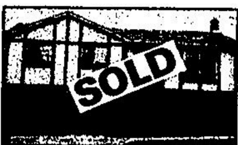
49 Stoney Drive — Sorry I'm Sold