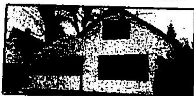
Super 4 Bedroom Starter $68,900