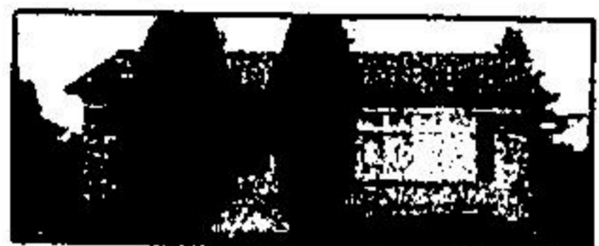
Are You Reading This Ad? Georgetown Buy — $75,900