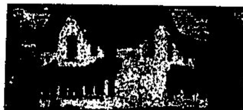
Possible 2 Family — $48,900