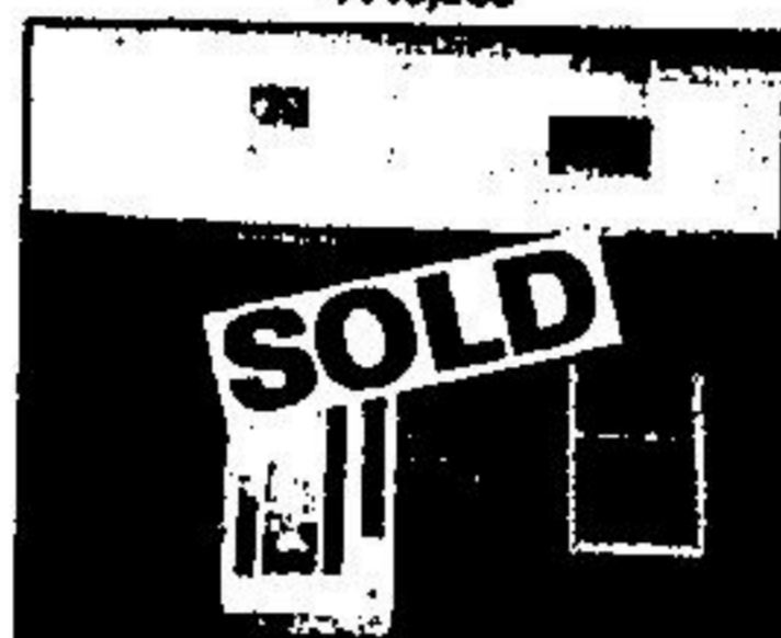
Acton Townhouse — Sold In One Day