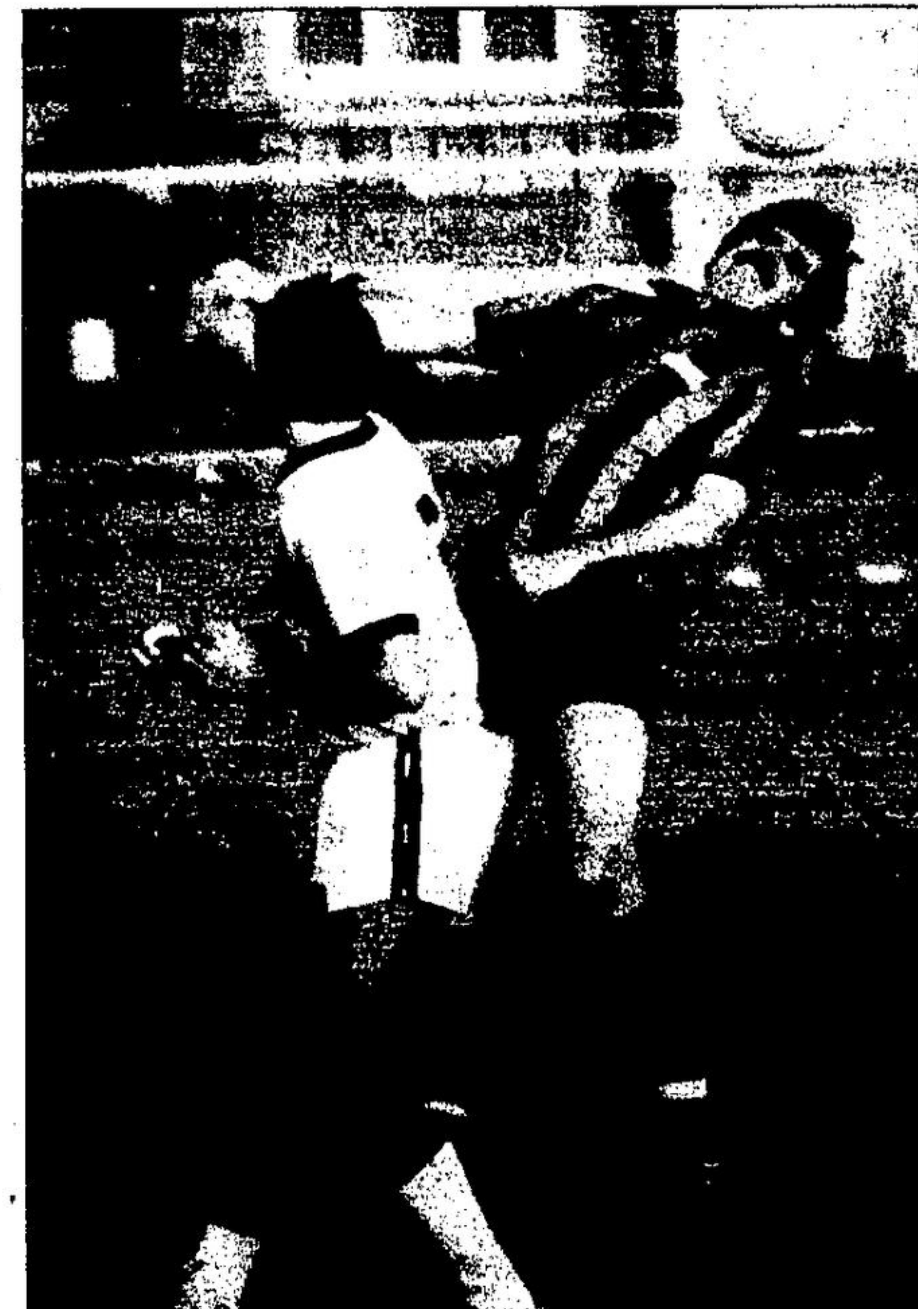
The Mariners had their hands full last Wednesday evening when they travelled to Acton to tangle with Villa 'A'. The Georgetown side used their experience, and heads, but to no avail as Acton scored a 3-0 win.

Team two of the juniors lost to Mayfield 12-0 and were blanked by Erindale 16-0.