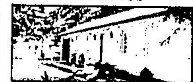
Sunday, May 27 1:00-3:00 p.m. Everton Village

Hwy. 25 North to Hwy. 24. Turn west (left) Hwy. 24 to 6th & 7th Concession (Teddy's Everton Inn). Turn south (left to Everton), follow signs to Victoria Rd. 4502