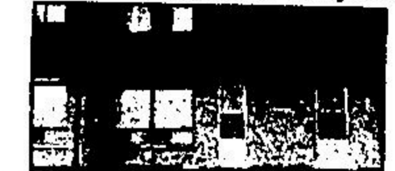
Georgetown 3 bedroom townhouse, excellent decor. $58,900.