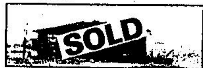
A LITTLE BIT OF COUNTRY 3 bedroom bungalow $69,900