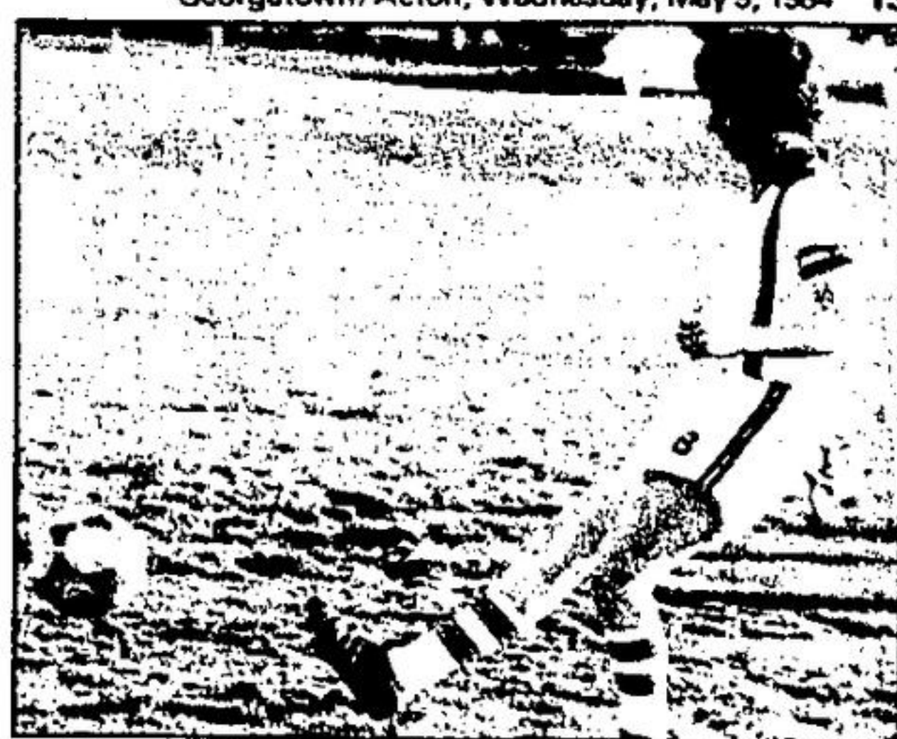
A mixture of Villa "A" and "B" soccer players took on Guelph Latinos at the McKenzie-Smith soccer field last week.