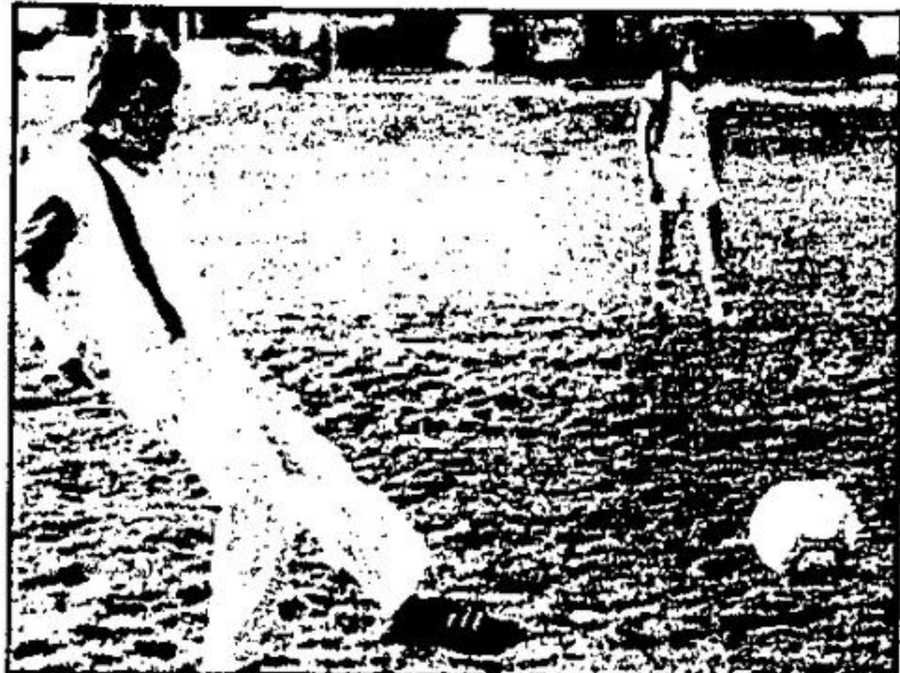
He shoots and he almost scores as a Villa Soccer player advances against the Guelph Latinos in an exhibition match at the McKenzie-Smith soccer field last week.