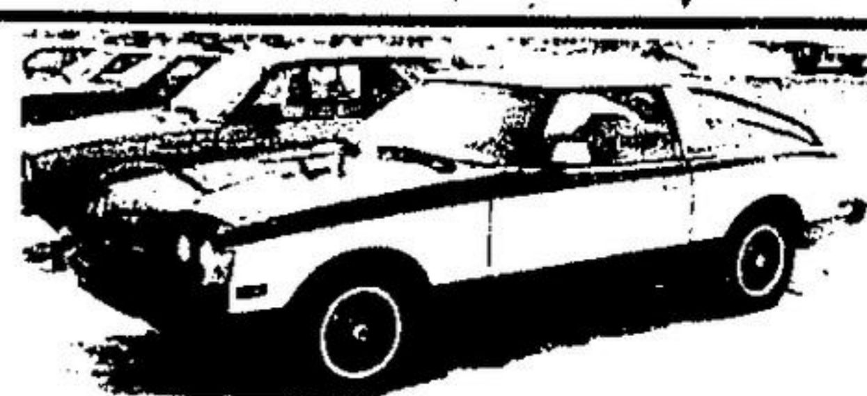
1979 TOYOTA CELICA G.T. 5 speed, one owner, like new. Stock 2060-1. 6 month or 10,000 km powertrain guarantee.