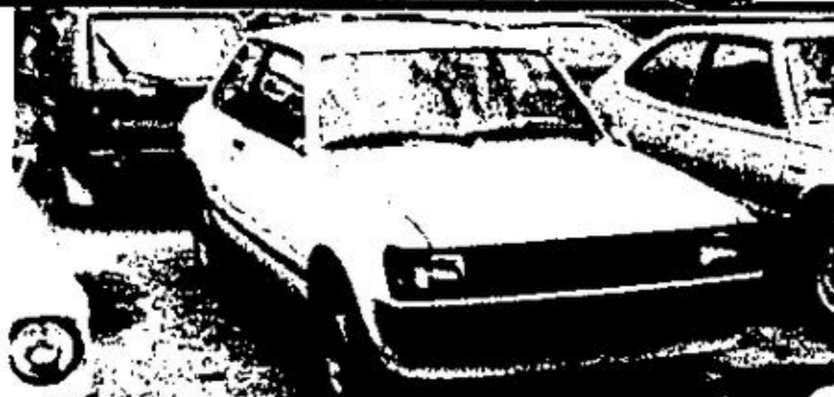
82 TOYOTA TERCEL Liftback, very low miles. Stock 3226. 6 month or 10,000 km powertrain guarantee.