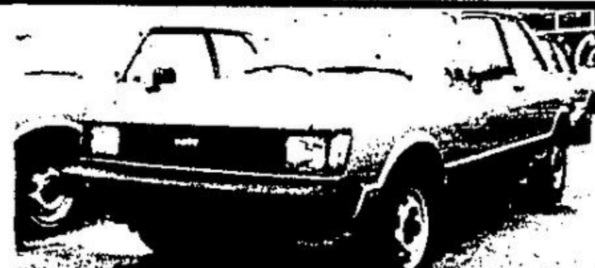
81 TOYOTA TERCEL 2 Door Sedan. Stock 3227. 6 month or 10,000 km powertrain guarantee. PRICED TO CLEAR!