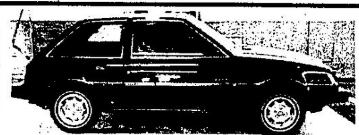
81 DODGE COLT Automatic, economical and reliable. Stock 2116-1. 6 month, 10,000 km powertrain guarantee.