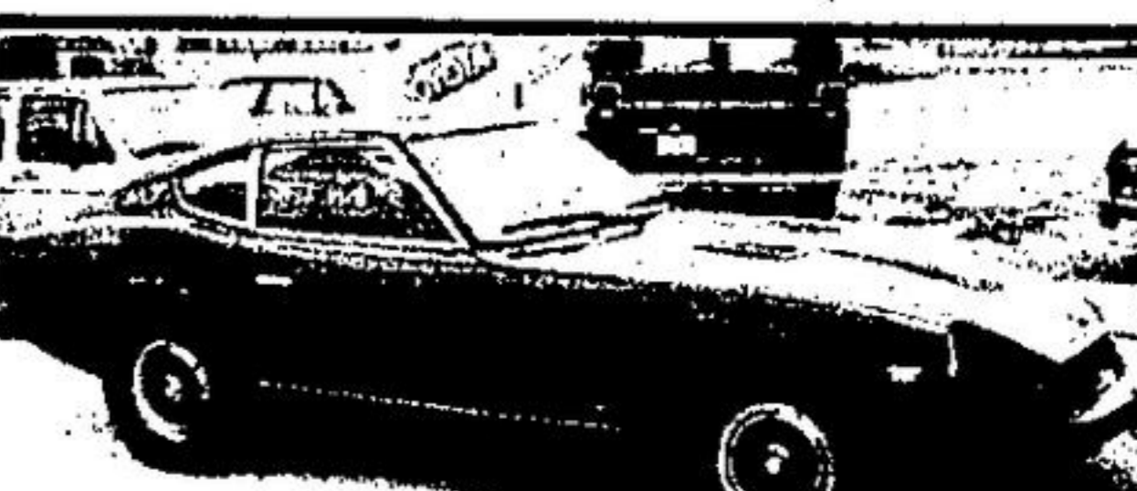
77 DATSUN 280Z 6 speed, sunroof, fuel injected, 6 cyl. Stock 3228.