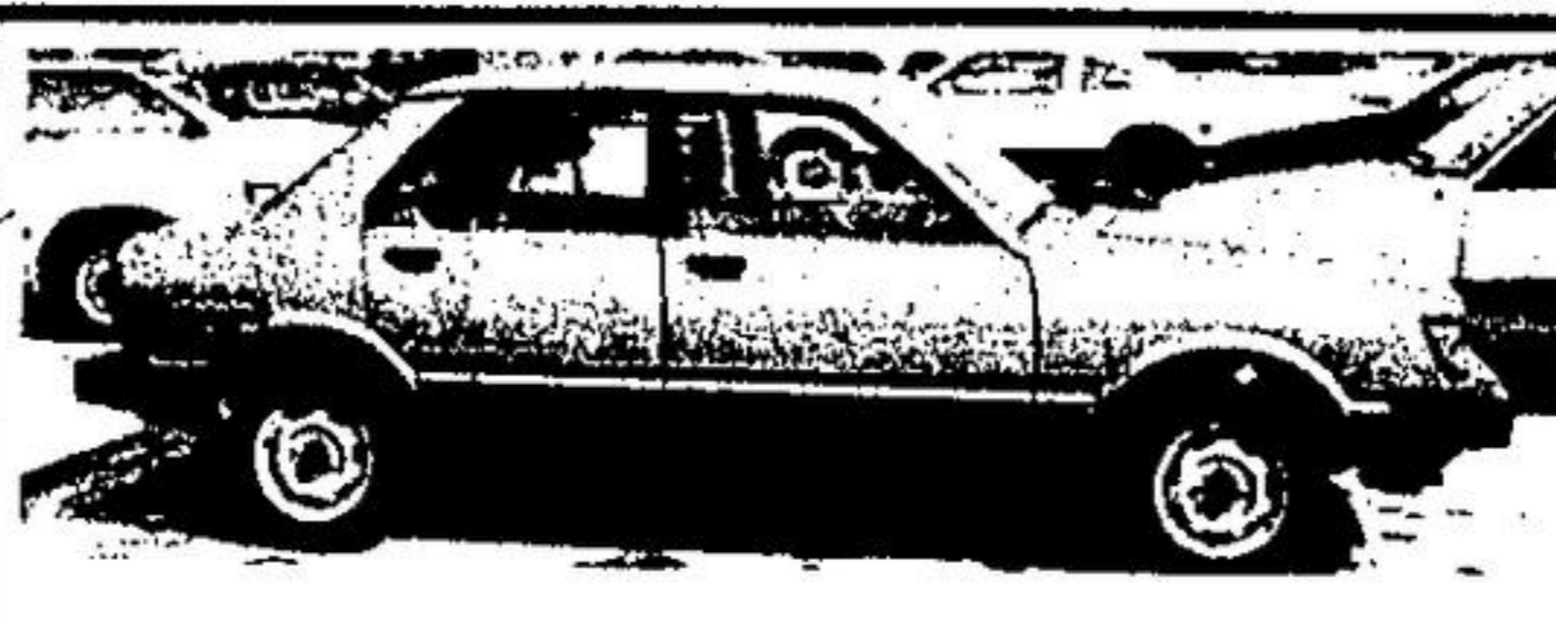
81 TERCEL 4 DOOR SEDAN Excellent family car. Stock 3218. 6 month or 10,000 km powertrain guarantee.