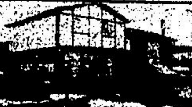
IF IT'S IMPORTANT TO YOU TO HAVE...

5 bedroom, 2 bathroom residence on 80 x 278 lot. Walk to downtown yet enjoy a side street. Local $84,900. Peter Thornton. RT84-15