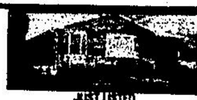
JUST LISTED GEORGETOWN

5 bedrooms, 4 separate bathrooms, 2 fireplaces and plaster construction in main home. Plus second house. All situated high up with approx. 90 acres of land $245,000. Like to hear more? Please call Peter Thornton. RT83-206