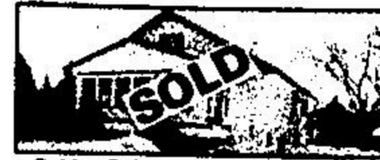
Sold - Sold - Sold - 7 Draper St.