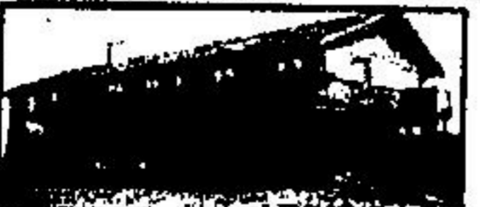
NEW LISTING "ONE OF A KIND"