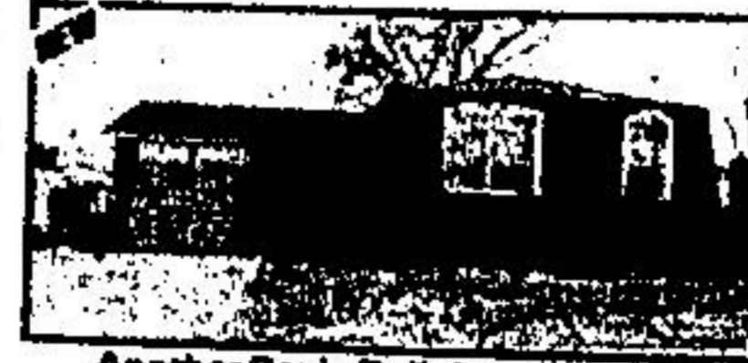
Another Boy's Delight - $82,800