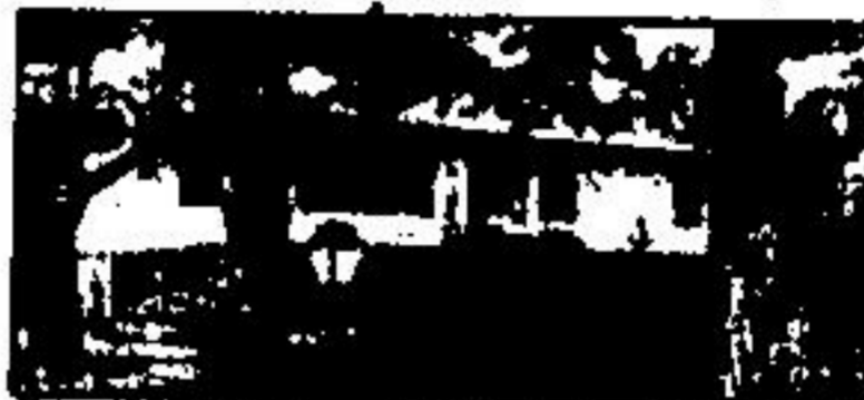
New Country Charming - $187,500 Edge of Town