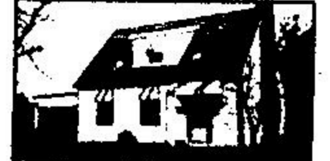
NEW LISTING $68,800

3 Plus bedroom home on large treed lot, finished rec. room with bar, den with fireplace, new roof, aluminum eaves, soffit and fascia plus inground pool for those hot days. Call Damian Nikic. RT84-69