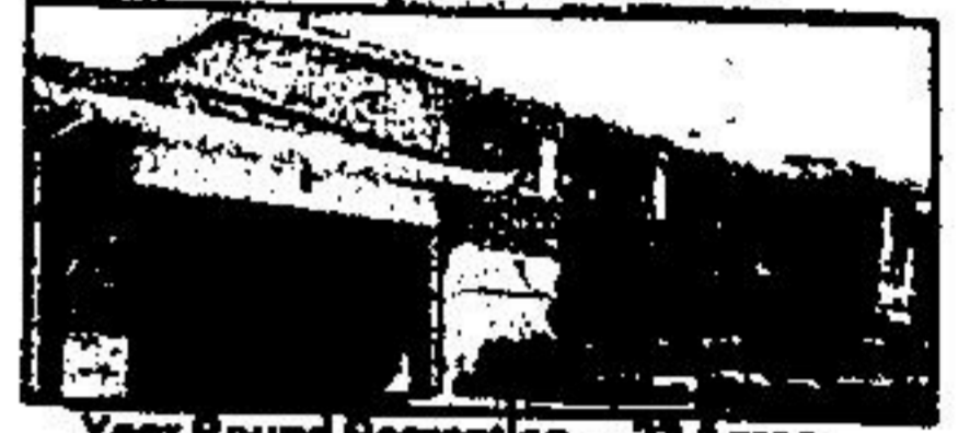
Year Round Recreation - 23 Acres, Bush, Ponds, Barn, Custom Home