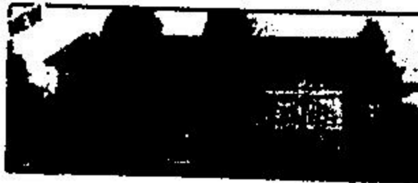
Spiffy Georgetown Starter - $77,800