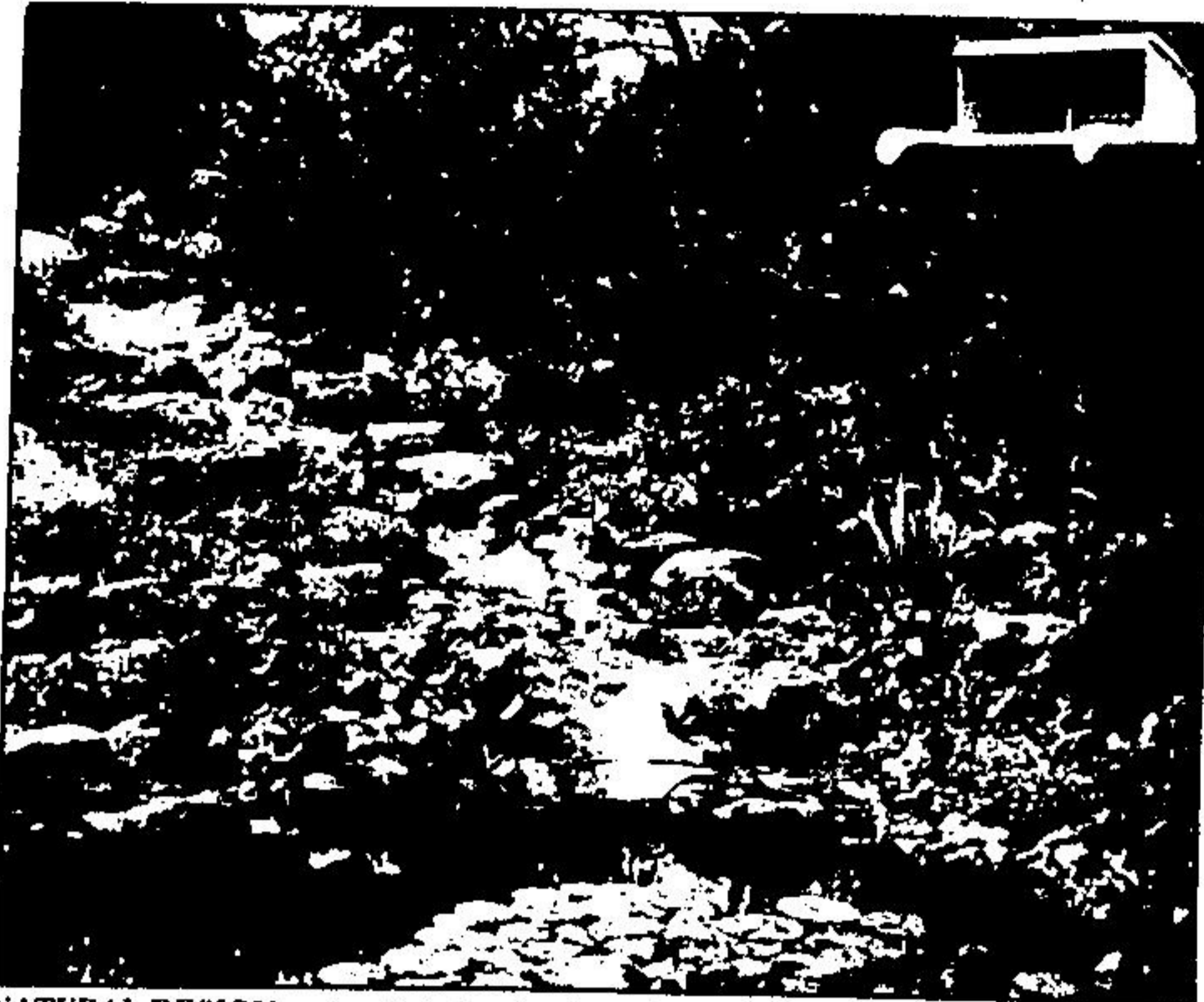
NATURAL DESIGN — A well-designed rock garden blends into the surroundings.