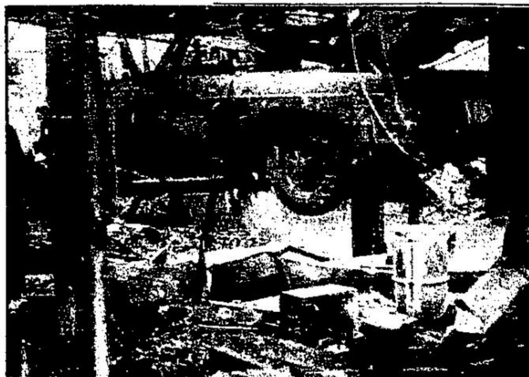
Cause of the fire Sunday at Eramosa Motors is unknown still and damages have been pegged in the neighborhood of $100,000.