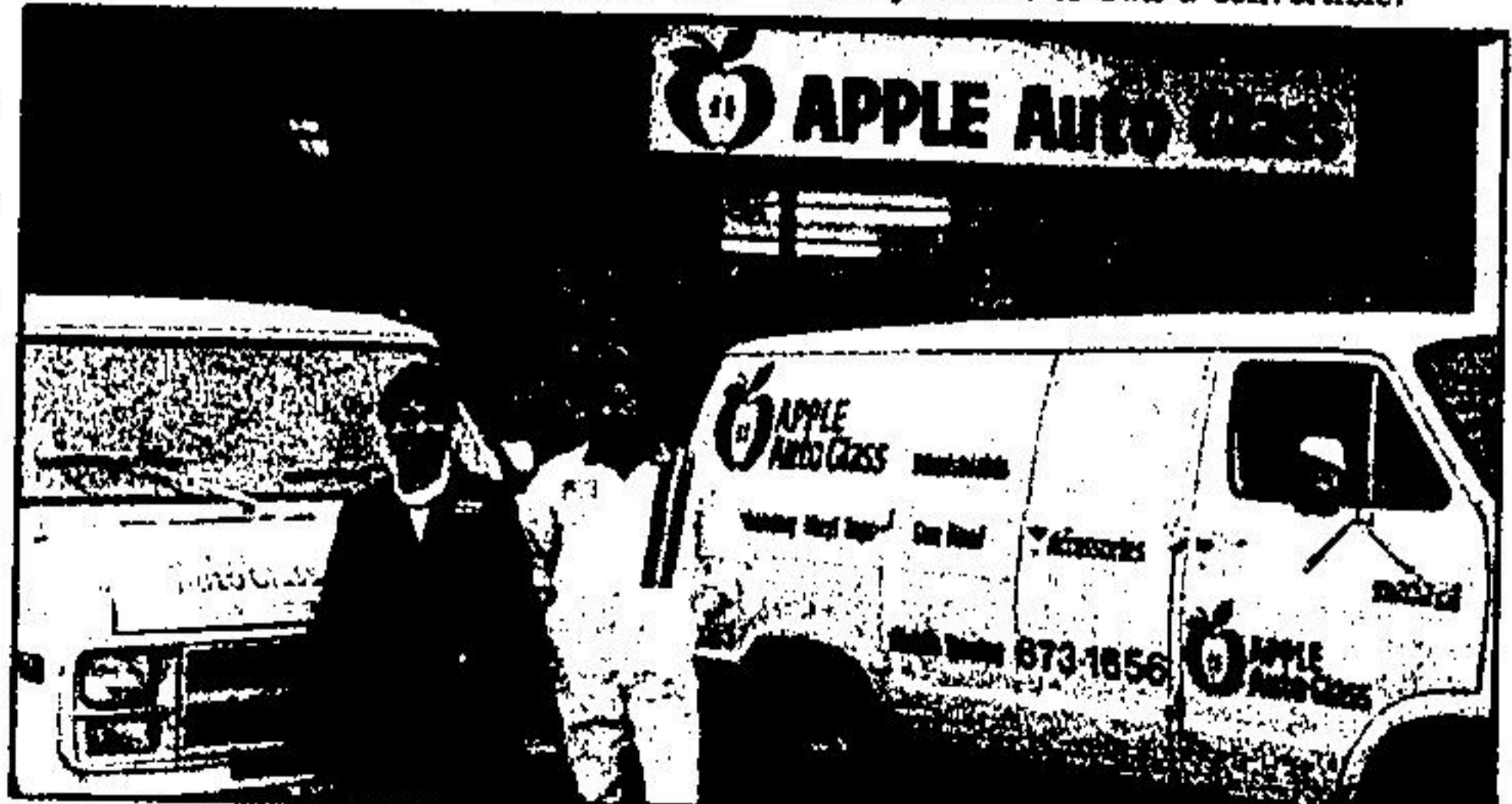
The new boys in town, Derek Hazelwood and Wade Bryanton, of Apple Auto Glass, seen here with their mobile auto glass repair unit. Only open a few months the pair is pleased with the way business has been going and anticipate spring and summer.