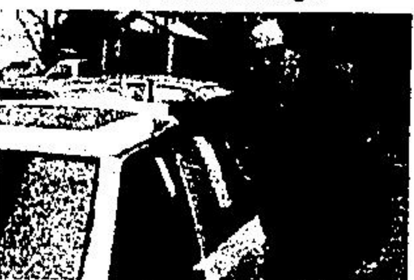
JIM WALSH Sales