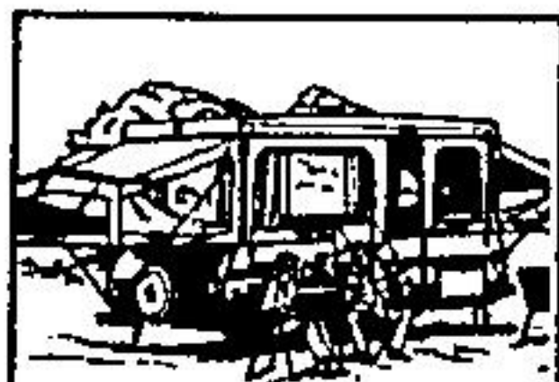
HARDTOP CAMPERS by STARCRAFT LIONEL

Your opportunity to discover your dream home on wheels, at great savings! Our heated indoor showroom features: