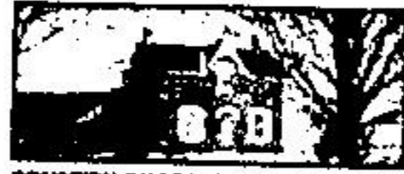
COUNTRY CHARMER WITH INCOME