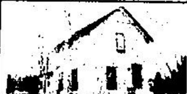
LAKEFRONT PROPERTY - ACTON

One chance in a lifetime to have your home on the lake. 3 bedroom home, separate dining room, living room, large kitchen, 2 washrooms. Must be seen.