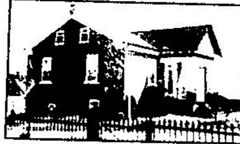
HISTORICAL GEORGETOWN "REV. ROBERT EWING ESTATE"