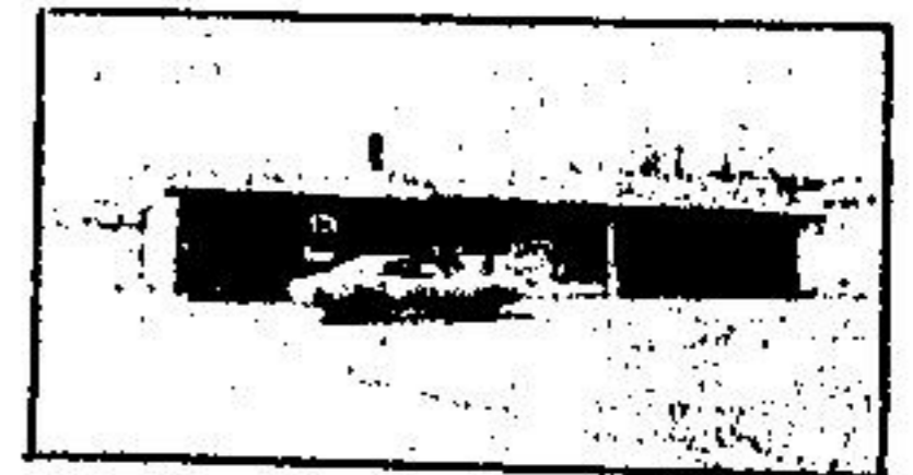
ACTON - 1 ACRE COUNTRY $114,900