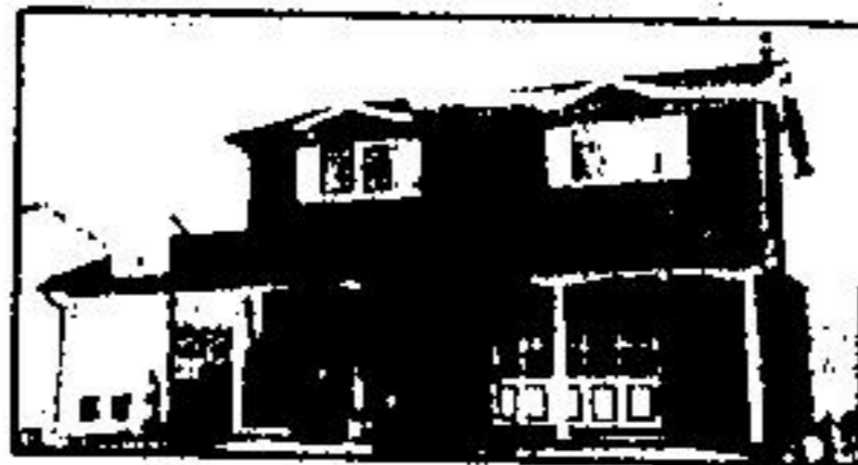
4 BEDROOM - EXCELLENT CONDITION THROUGHOUT - $81,000