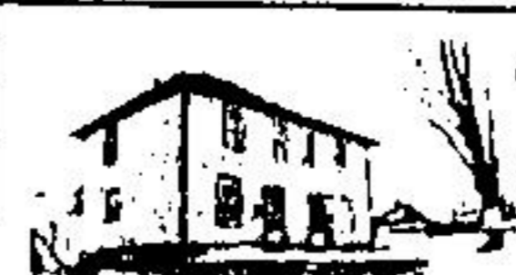
2 HOMES, 1 PRICE