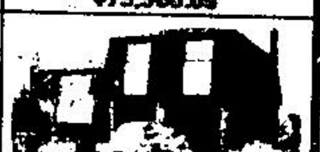
VIEW THE LAKE

From your own deck, large fenced lot, 3 bedroom double master's duplex, main floor family room with fireplace. Finished RR, eat-in kitchen, dining room & living room.