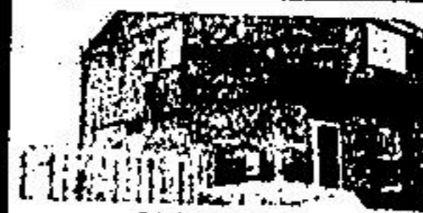
PRICED TO SELL

Better than new, immaculate semi detached, 3 bedroom, eat-in kitchen, comb. living & dining room, finished RR, privacy fence and cedar hedge over 200 bulbs planted for your spring enjoyment. Only $58,900.