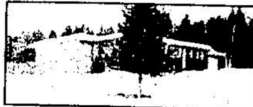
6 ACRES & GOOD QUALITY HOME $119,000