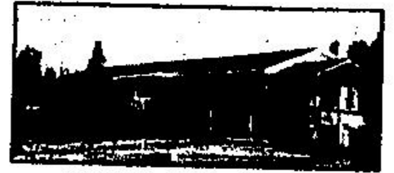
23.8 ACRES, BUSH, PONDS, 2,000 SQ. FT. CUSTOM BRICK - $148,000