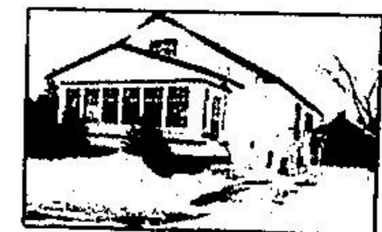
SATISFY YOUR CURIOSITY CALL TO SEE THIS ONE