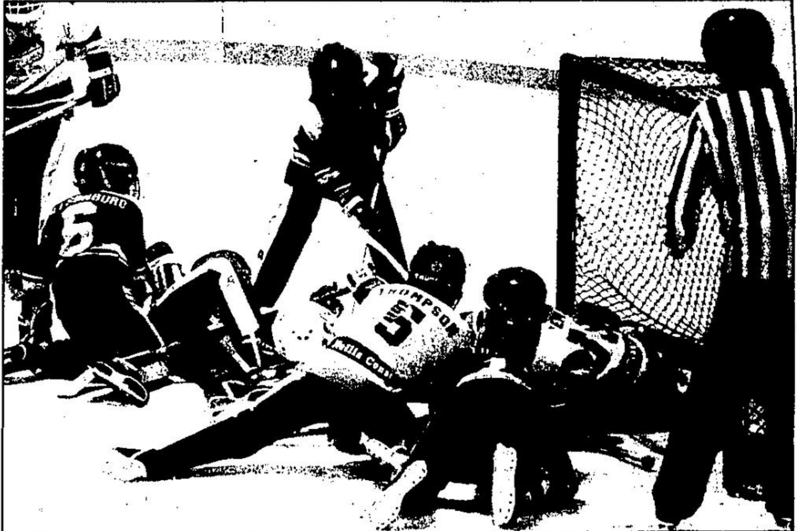
There was a huge pile up in front of the Acton goal as the Tillsonburg Rotary Bantams attacked. Tillsonburg won the championship match 2-0 despite a superb effort by the Nellis construction Atoms.