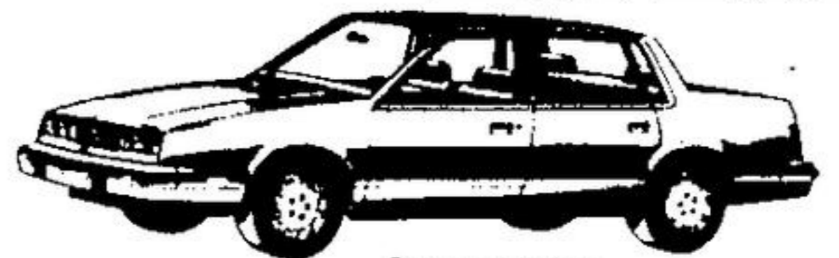
Pontiac 6000 STE