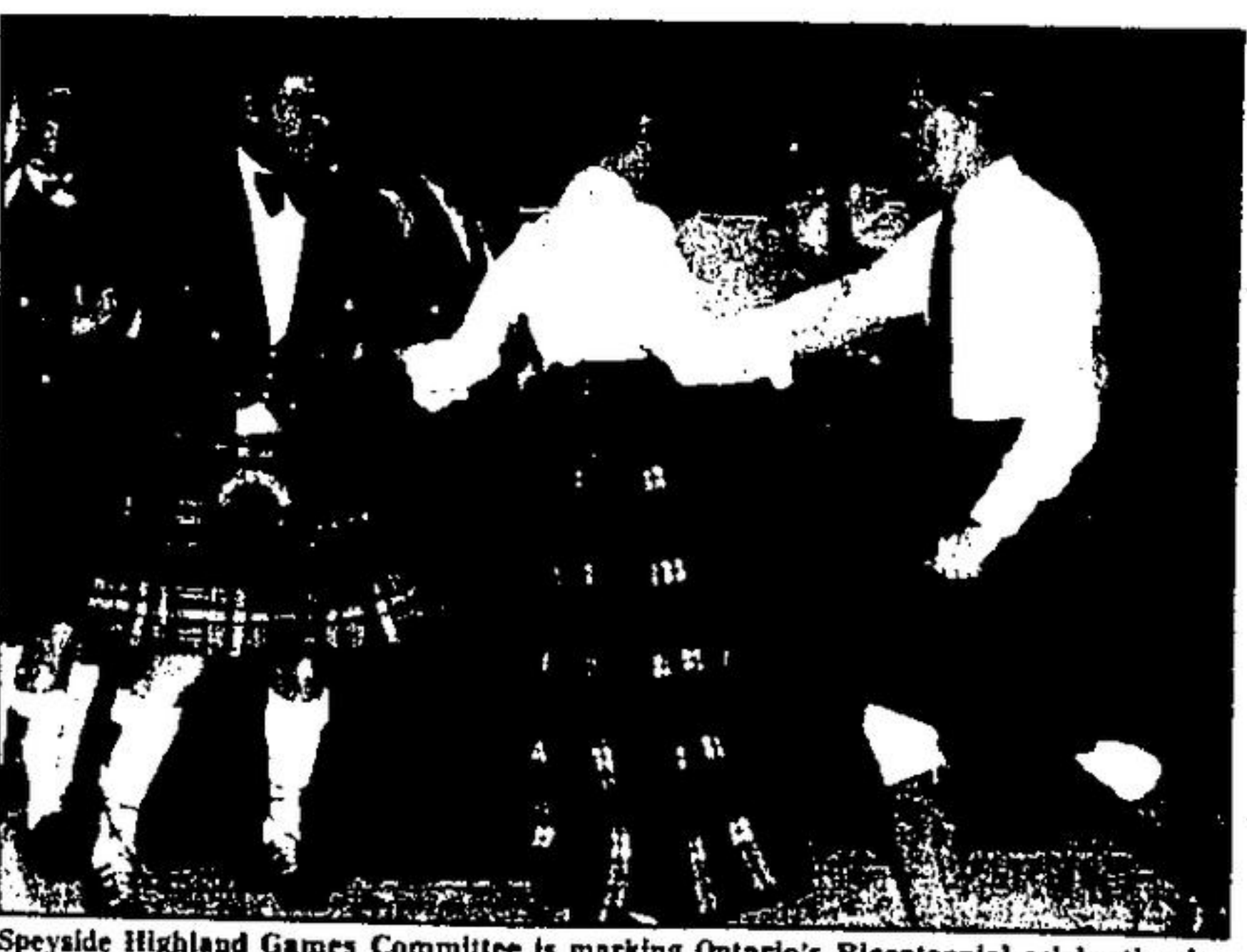
Speyside Highland Games Committee is marking Ontario's Bicentennial celebration by holding a Highland Ball, March 23, where scenes like this will be reenacted in Holy Cross hall. The Highland Games Committee plan a gala affair to mark 200 years of Ontario's history, to which the Scots contributed their share.