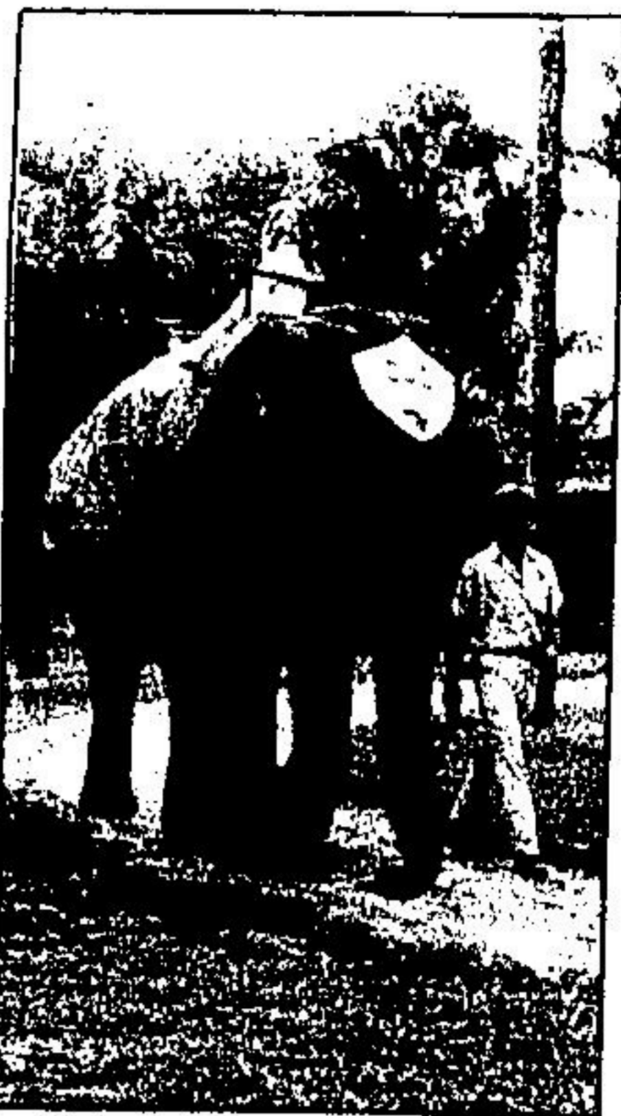
Stacy Bellamy enjoys her ride on the elephant at Busch Gardens.

Meet the most beautiful birds in the world—pink flamingos, blue and gold macaws, black swans, scarlet macaws, cockatoos, Amazon parrots—hundreds of rare birds can be seen here among the lush foliage and peaceful waterways. And the Bird Theatre, you'll see some of these magnificent creatures perform amazing feats in an unforgettable show.