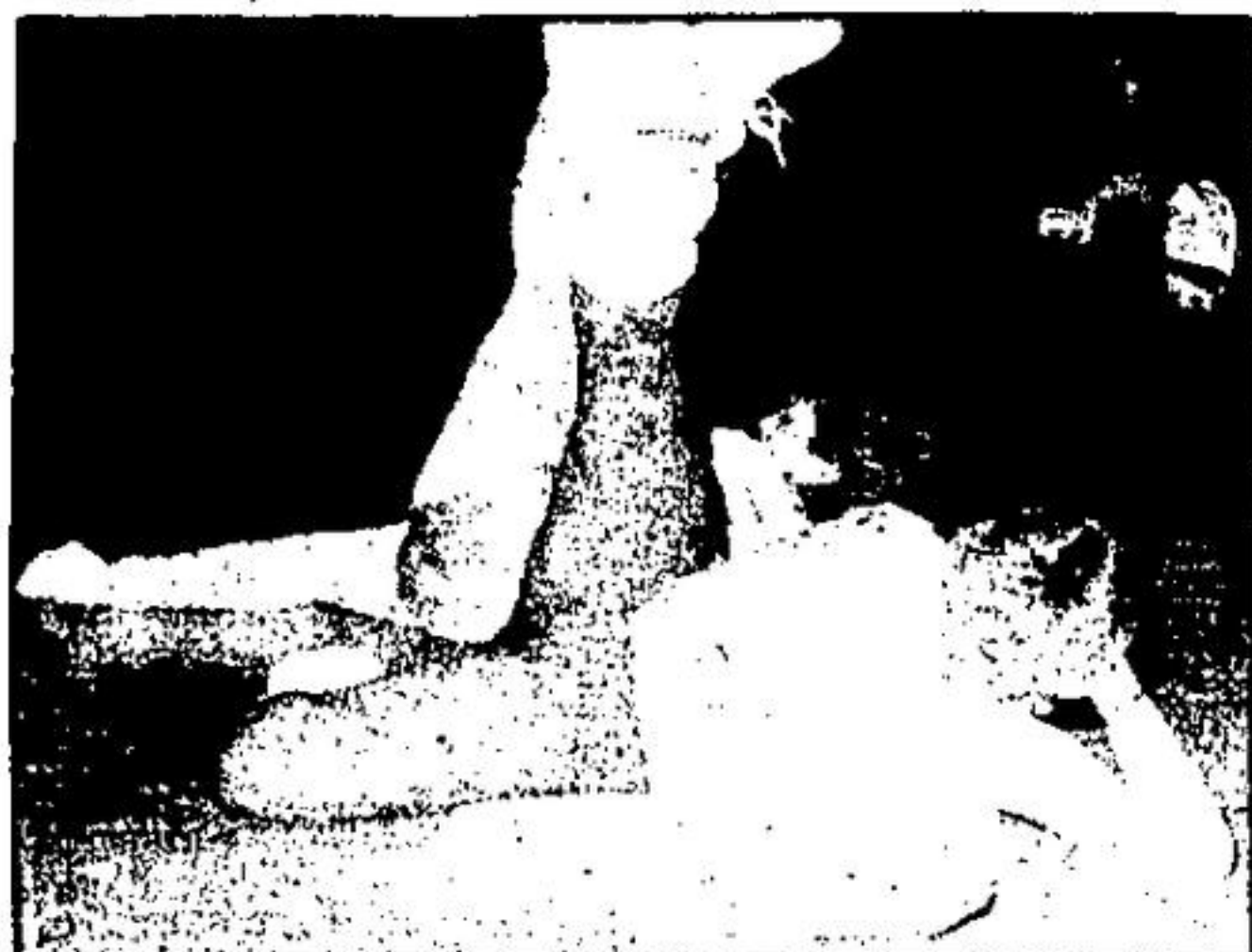
Shelly Winter (foreground) and Sue Dodds do a few leg lifts at a ladies' fitness class.