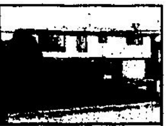
IT'S ALL HERE - $79,900

3 bdrm brick raised bungalow, family room, bar room, 2 baths, garage, inground pool, 150 ft. fenced rear yard, possible in-law suite. Call Anne Genoe 877-5296. 3268