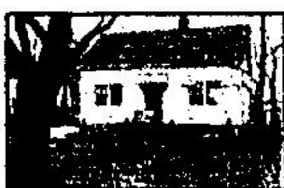
COUNTRY SIZED "IN TOWN" LOT