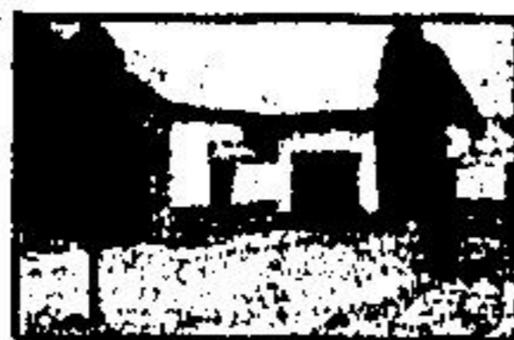
GET YOUR MONEY'S WORTH $69,900