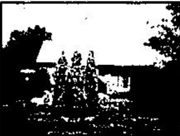
WHERE EVERYONE WANTS TO LIVE

Panoramic view across valley is unbelievable, country bungalow on 1/2 acre in village of Catawact. Asking $99,900. Please call Cam Eades 877-5296. 3264