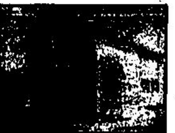
WANT COUNTRY YOU CAN AFFORD?

With in-law suite. $68,900. Brick 2 storey, close to shopping. 2 storey home with spacious 3 bdrm home and 2 bdrm in-law suite. Private entrance. Call Barbara (McMullen) Glenn 877-5296. 3278