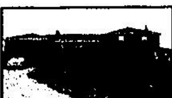
VALUE VALUE VALUE

6 yrs. new, 4 bedroom custom home on 10 acres. Big, big rooms, 3 baths, 3 fireplaces, built in appliances & much more. Only $129,000. Call Marg Parker 877-5296. 3153