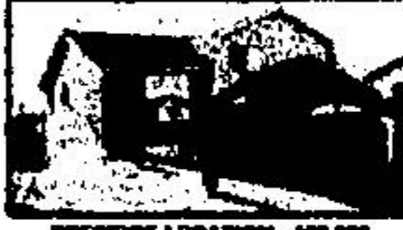
PRESTIGE LOCATION - $89,900

3 acres, stream, beautifully maintained 3 bed bungalow with single garage and a super sun porch at rear. Its terrific for $95,000. Call Ellen Hogg for more details 877-5296. 3273