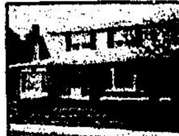
$121,000 SAUNA - POOL

2 acre estate home with unique design, 3 4 bdrms with extra sized master with corbyr. studio. Cathedral ceilings, spiral staircase in brick tower with built in fireplace. Call Barbara (McMullen) Glenn 877-5296. 3186