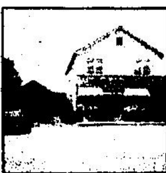
WORK FROM HOME

Well constructed solid, 2 yrs. new. Economical to heat & maintain, 3 bedrooms, 1 1/2 baths, gleaming knotty pine floors, beamed ceilings. Full basement. $119,000. Call Marg Parker 877-5296. 3277