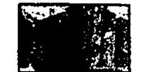
FIRST TIME BUYERS

$19,900. With nearly 1/2 acre. 50 min. from Georgetown. 3 bdrm cottage with 100 amp service. Wood stove in L.R. Call Barbara (McMullen) Glenn for details. 877-5296. 3207