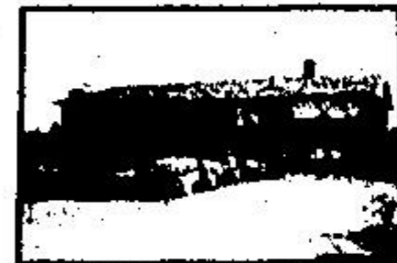
ON THE EDGE OF TOWN

3 bedrooms plus den. Beautiful brick bungalow on well treed lot in Park area. Fireplace in living room. Tasteful recreation room features Franklin fireplace. It's a gem. $109,900. Call Marg Parker 877-5296. 3249