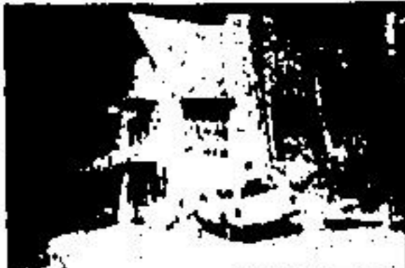
CALEDON SKI CLUB CHALET