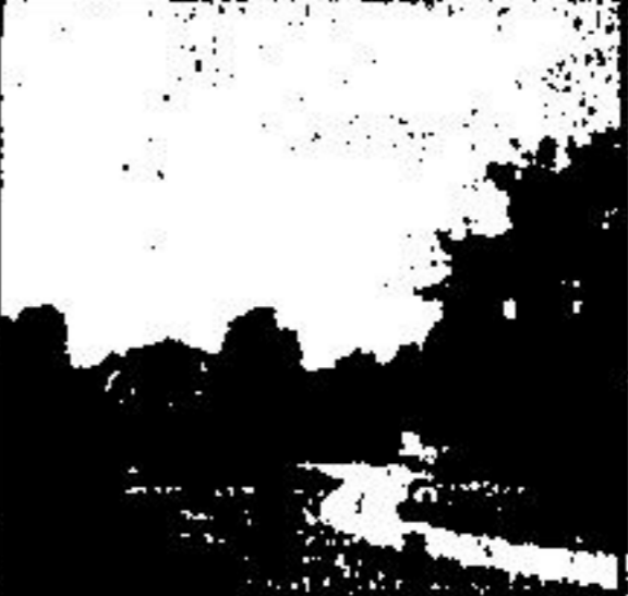
COUNTRY GENTLEMEN - $135,000

with new 3 bdrm home to be completed. Just outside Enn. Fabulous spring fed trout ponds on property, one 3 acre and one 4 acre pond. Call Barbara (McMullen) Glenn 877-5296. 3202