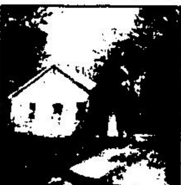
ROOM TO EXPAND - HIGHWAY PROPERTY

Completely detached 3 bedroom home, 2 baths, attached garage, large fenced yard in prime "lakeview" area. Call Anne Genoe 877-5296. 3248