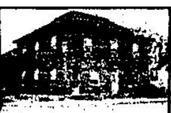
$85,900 - 4 PLEX

58 x 375 ft. It goes along with a cozy 3 bedroom 1 1/2 storey maintenance free home, new pine kitchen, 1 place in living room, hardwood floors, detached garage, minute walk to all schools. Call Anne Genoe 877-5296. 3275