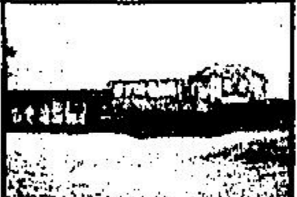
CALEDON AREA - CALLING ALL ARTISTS

Only minutes to Hwy 7 & town, 4 bdrms, living & dining room, bright eat in kitchen, family room with fireplace, double garage. Call Anne Genoe 877-5296. 3234