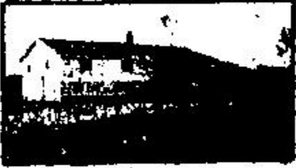
LOVELY 6+ ACRES

6 yrs. new, 4 bedroom custom home on 10 acres. Big, big rooms, 3 baths, 3 fireplaces, built in appliances & much more. Only $129,000. Call Marg Parker 877-5296. 3153