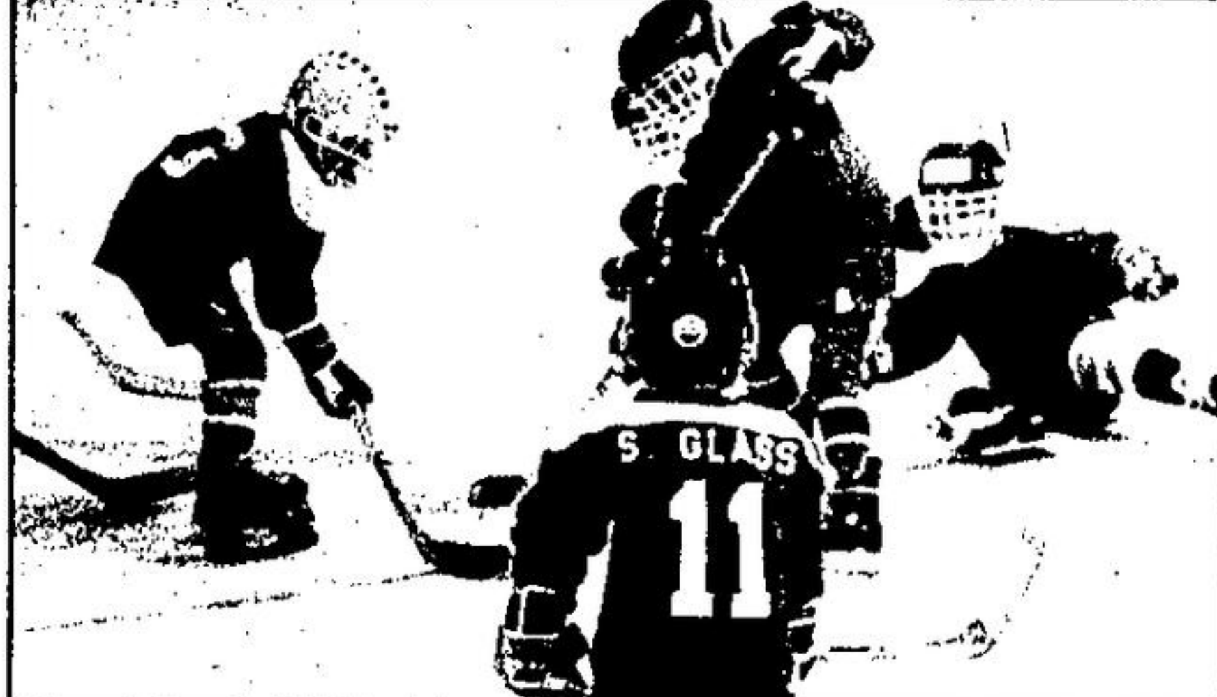
In Novice house league action recently Brampton and Burlington met in a highly contested match. Brampton finally overcame their opponents 6-2.