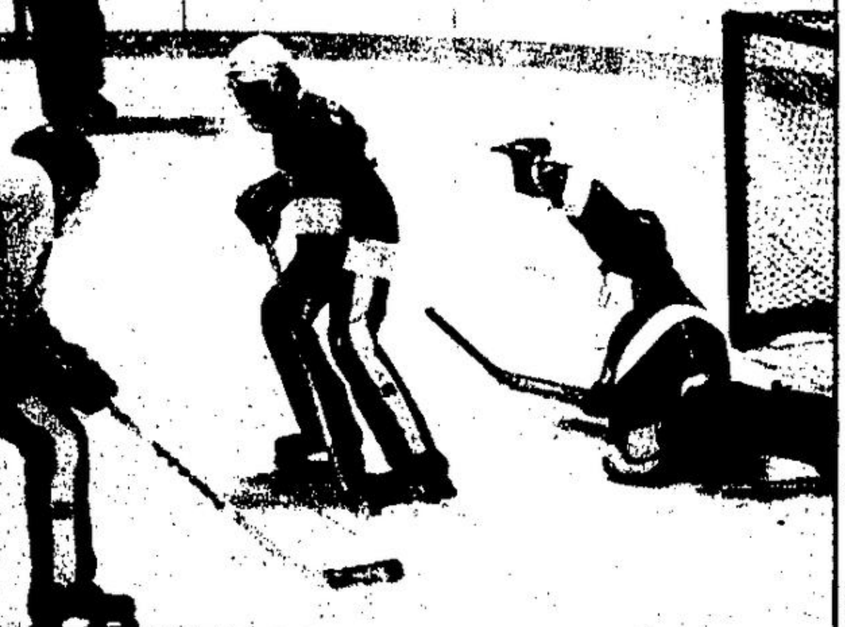
There was an exciting scramble in front of the Preston goal in Bantam Rep hockey action recently. Acton downed Preston 4-0 in this game.