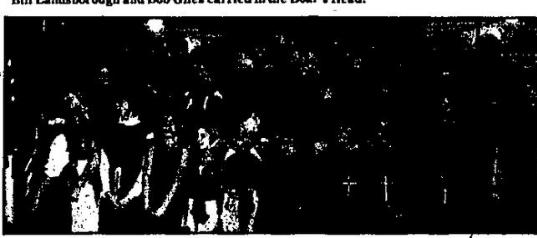
Without the many fine singers, the Boar's Head would not be the success it always is.