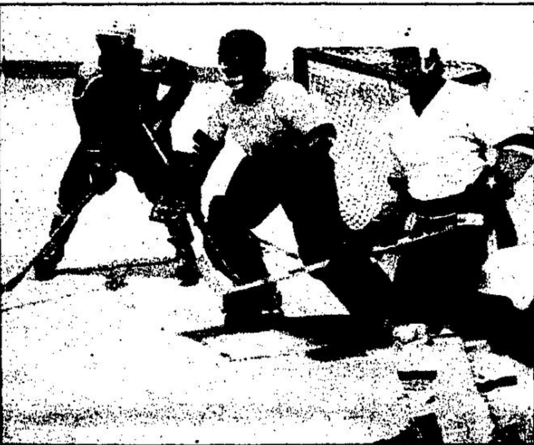
A Nielsen's Clothing player waits for the puck in front of the Lakeview goal, Nielsen's won the match 7-3.