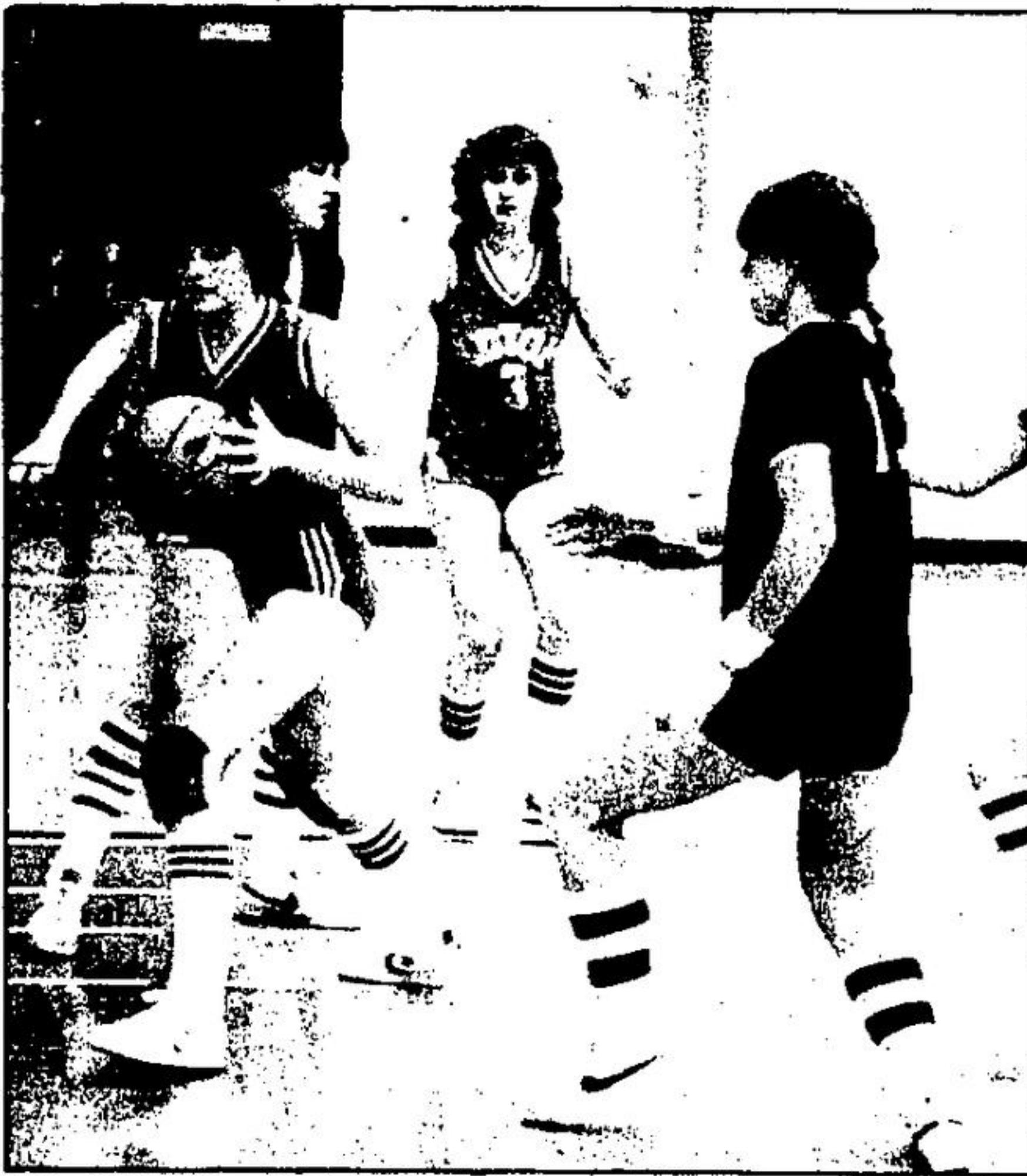
A Junior Redman goes for the basket in an exhibition game against Centre Wellington last Friday. The Redmen also played their first playoff match on Wednesday downing White Oaks 32-23 and will be playing in the semi-finals November 23.