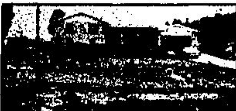
Country Custom & Pond