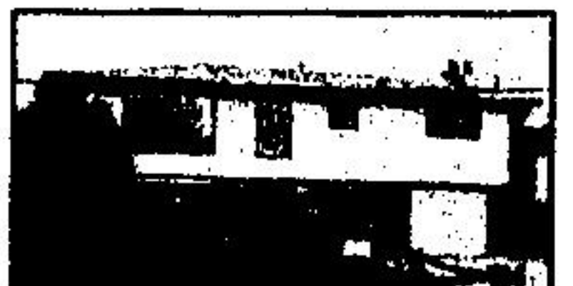
Large Private Lot & Pool