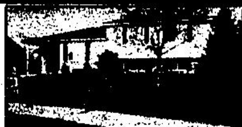
Bowie Beauty $82,000