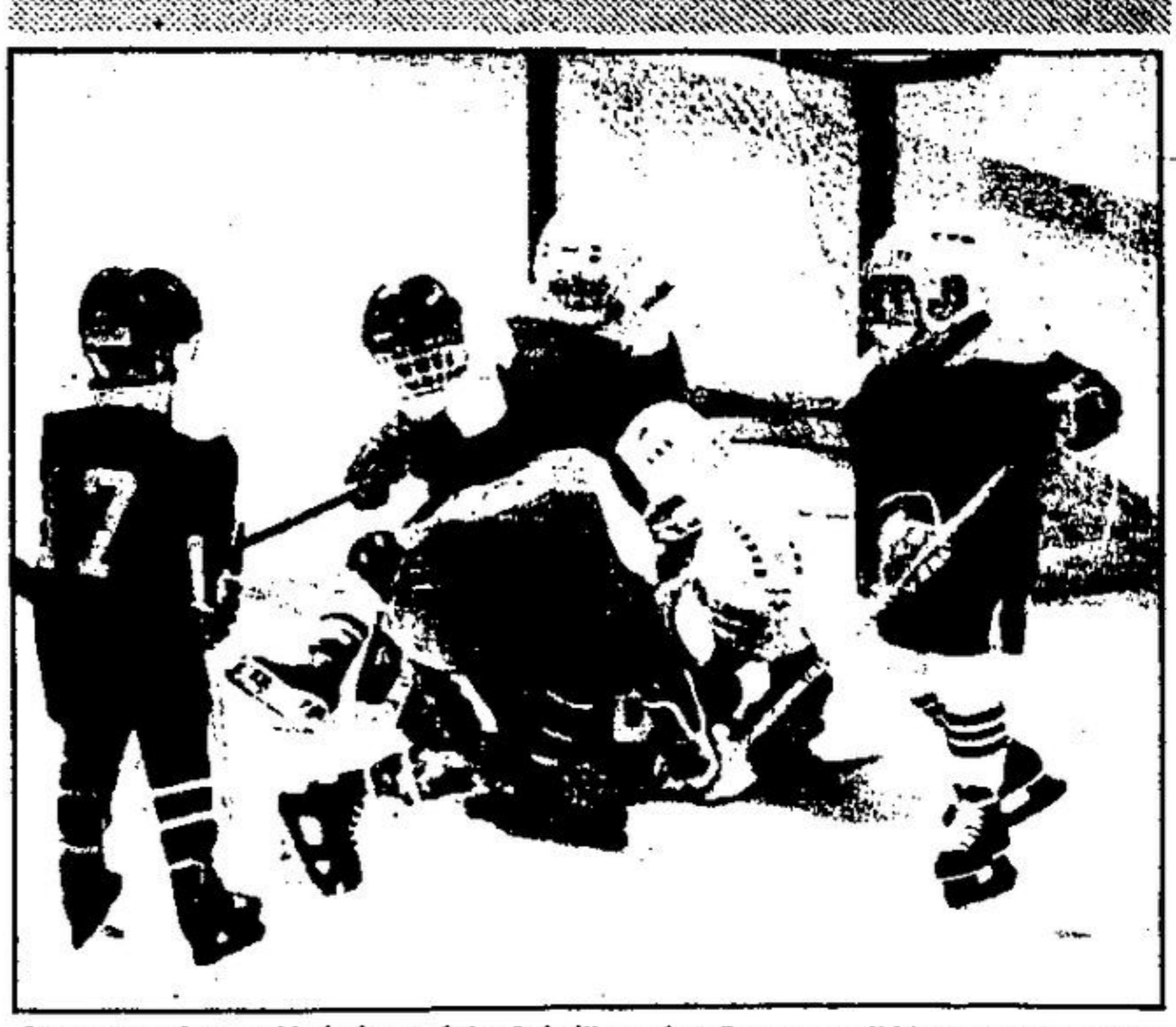
It was a mad scramble in front of the Oakville goal as Brampton did its best to break the Oakville shut-out in recent house league play.