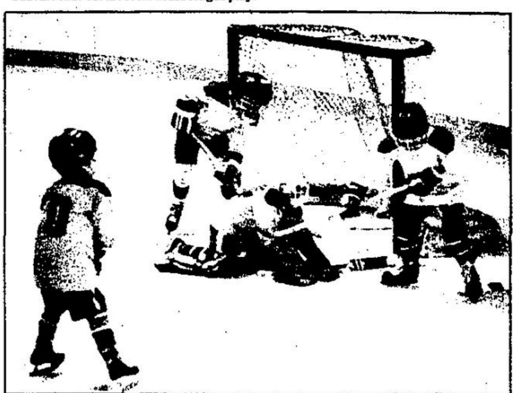
Dixie vs. Guelph in Novice house league play recently.