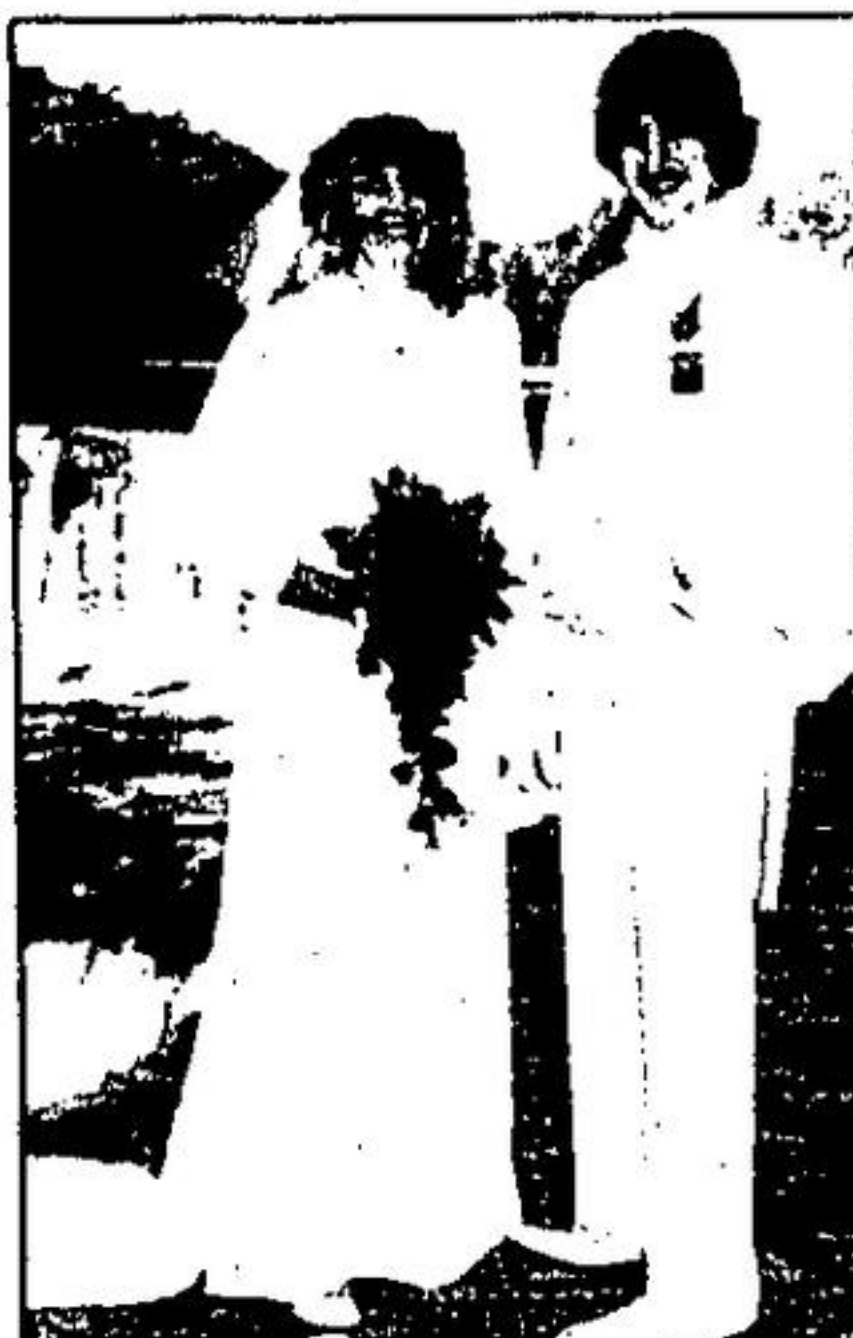
Sandy Wyga and Bill Biffis were married in Rockwood, September 24.