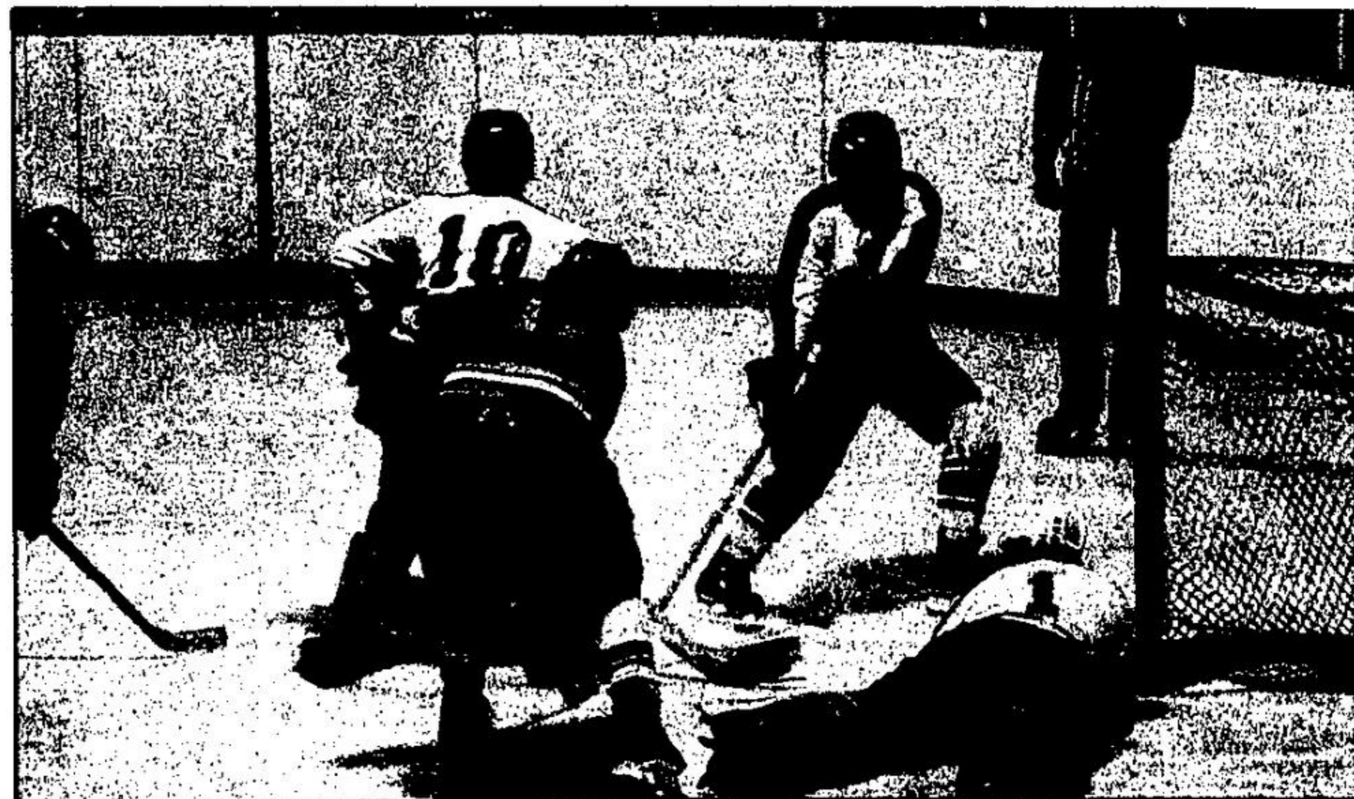
In industrial league action Heller's lost out to Acton Travel 6-1 Sunday night. Here they mix it up in front of the Heller's goaltender Bill Routledge.