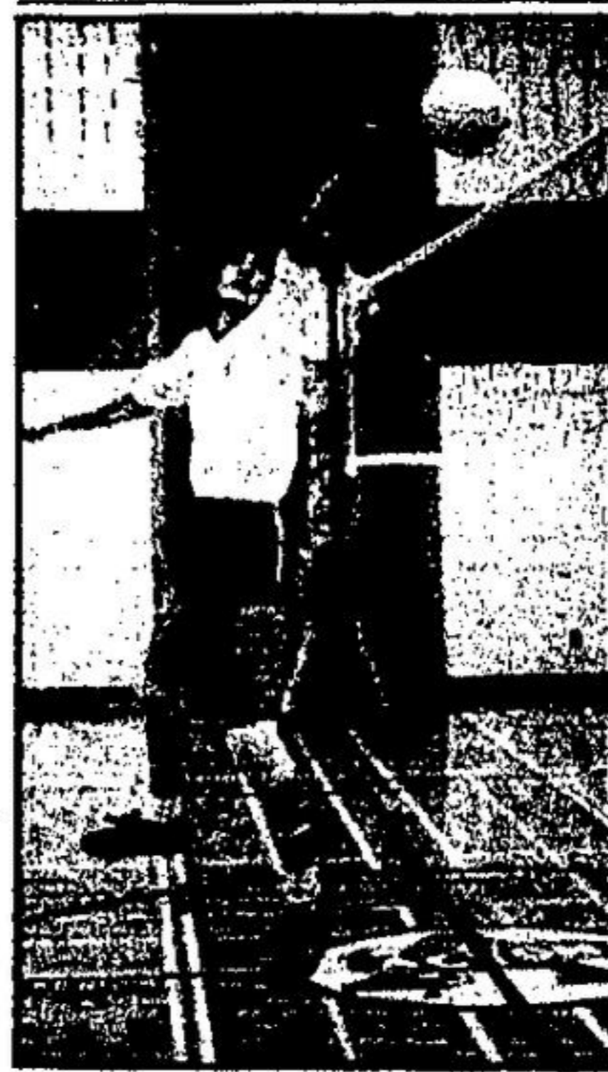
The Junior Redmen played strongly against Perdue on Friday but a strong opposition managed to defeat the local team twice in a three game series.