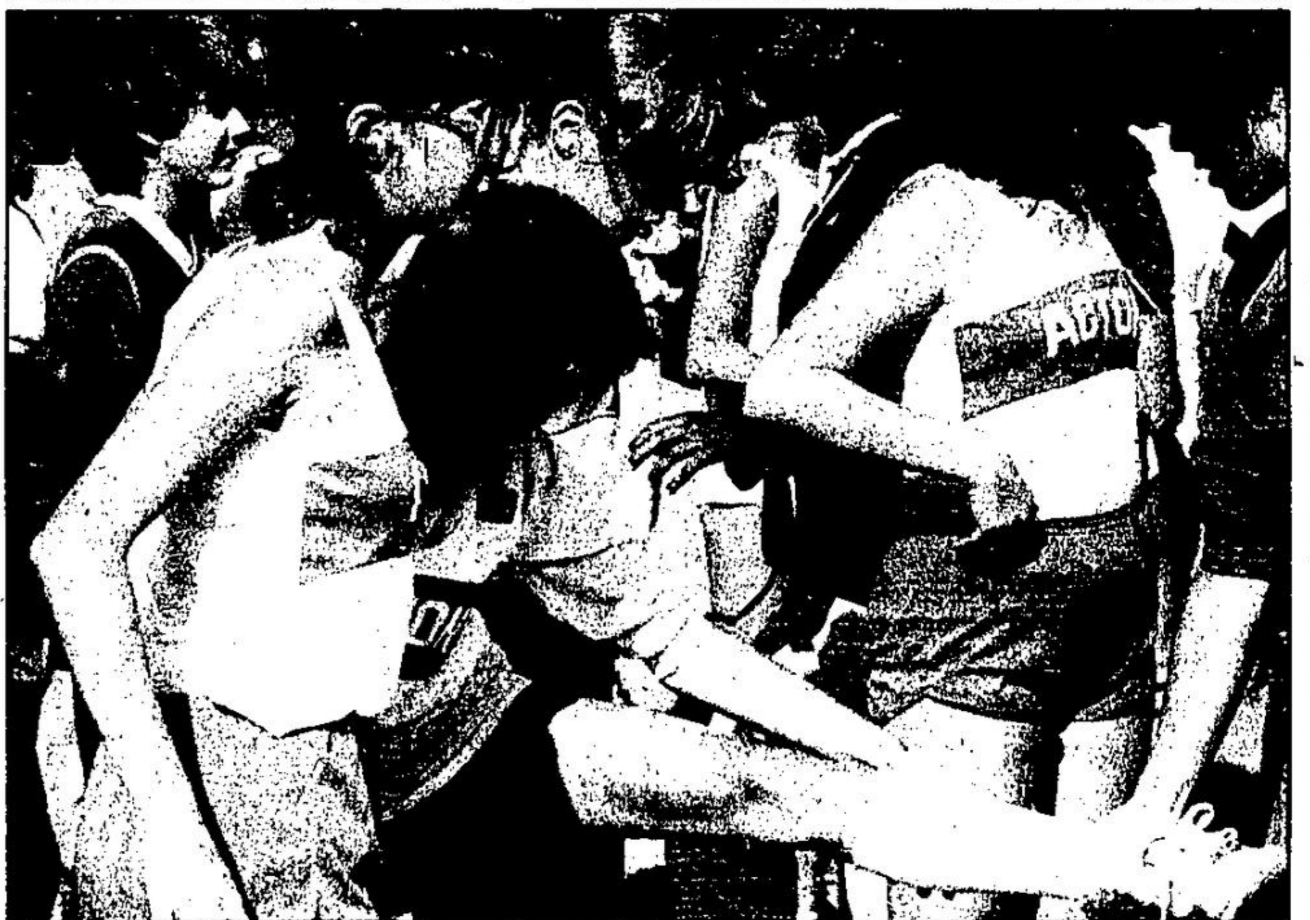
Several members of the Acton Midget Girls' cross-country team do some warm up stretches in preparation for a 2.2 mile run up and down the slopes of the Chicopee Ski Club. The Redmen placed 19th overall in competition against 58 schools.

The Leathertown men will take on the Toronto Aces at St. Laurence on Sunday October 16, at 12:30 p.m.