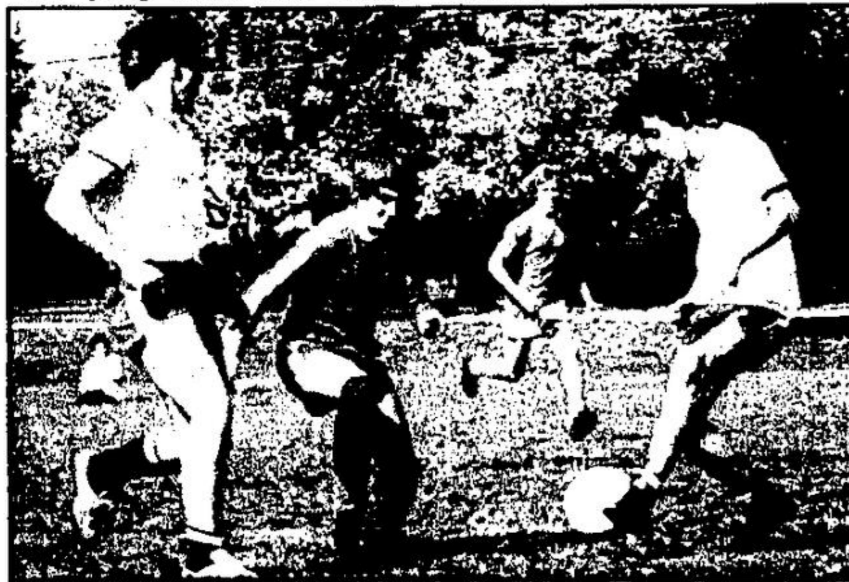
A Leathertown soccer player outmaneuvers a Georgetown player in the men's league finals on Sunday.