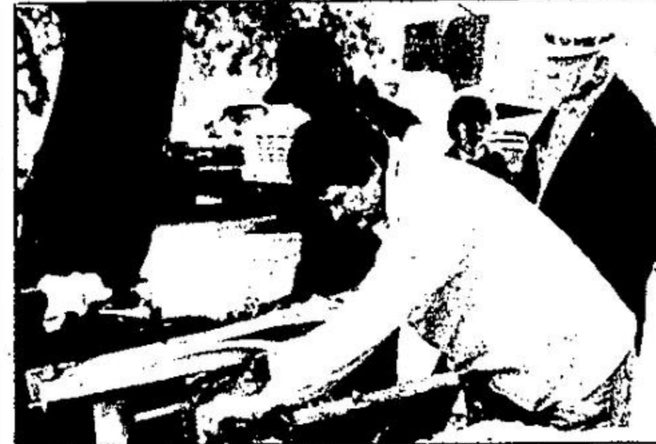
Readying the model boats for a run.