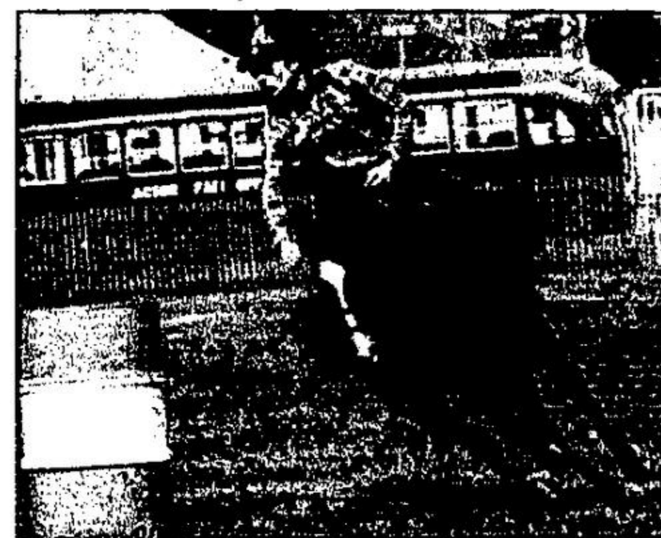
Horses of all types were at the fair.