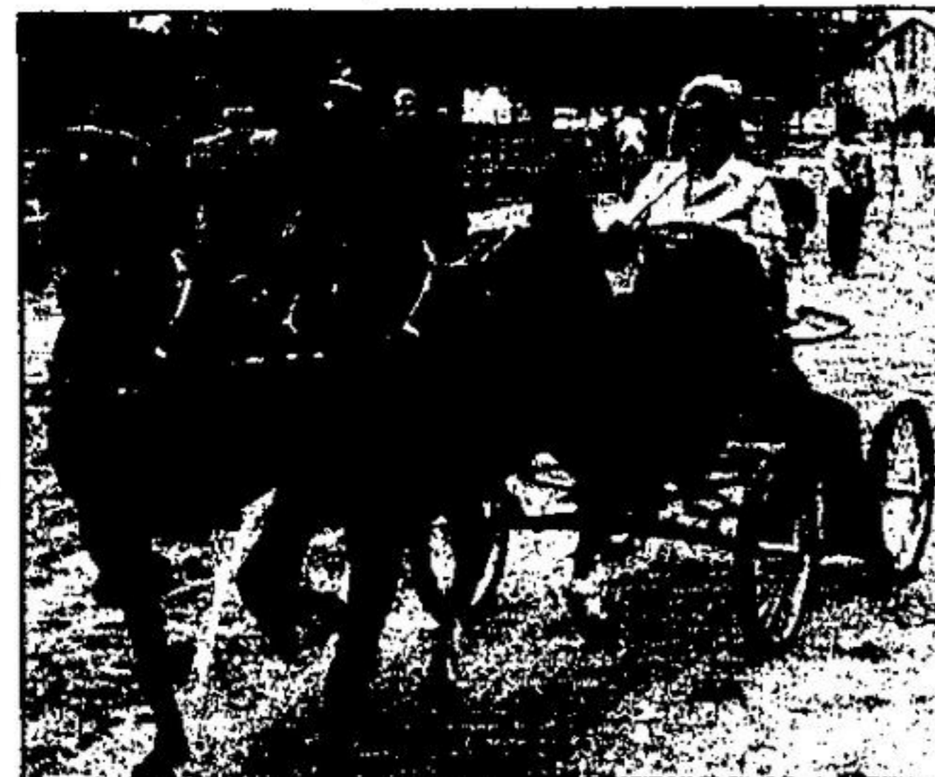
Many trotter horses were entered in competitions over the weekend.