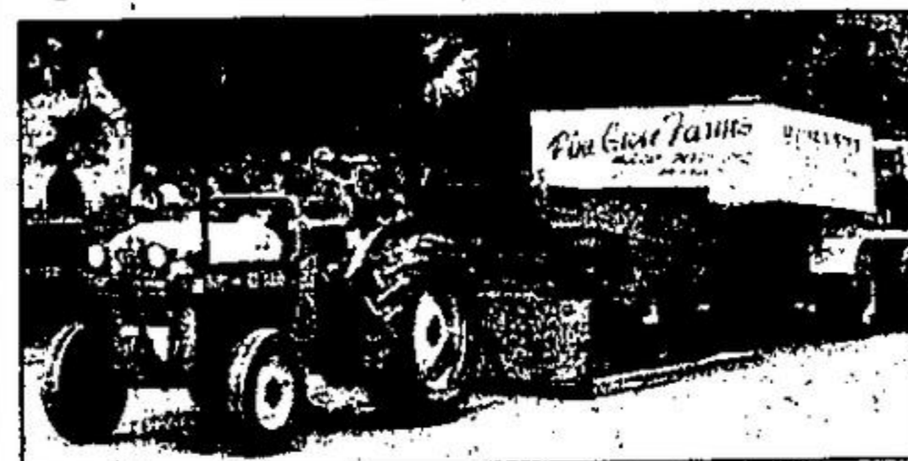
Tractor and 4 x 4 pull action drew on enthusiastic audience.