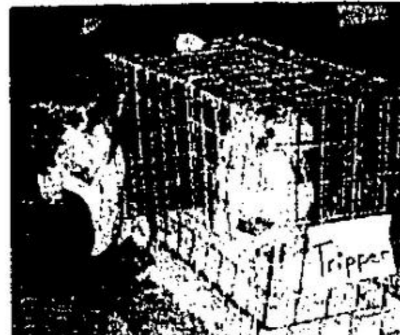
Urging your rooster in the crowing contest Friday night.