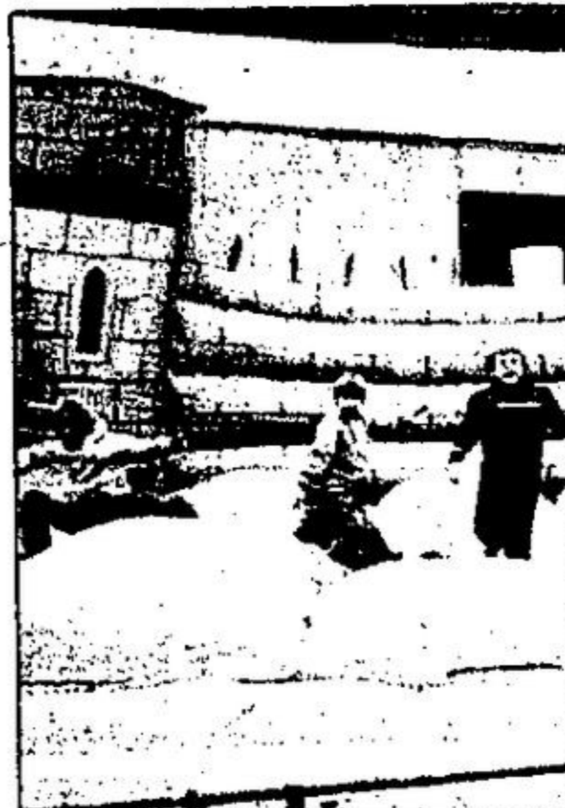
One of the more popular midway attractions.