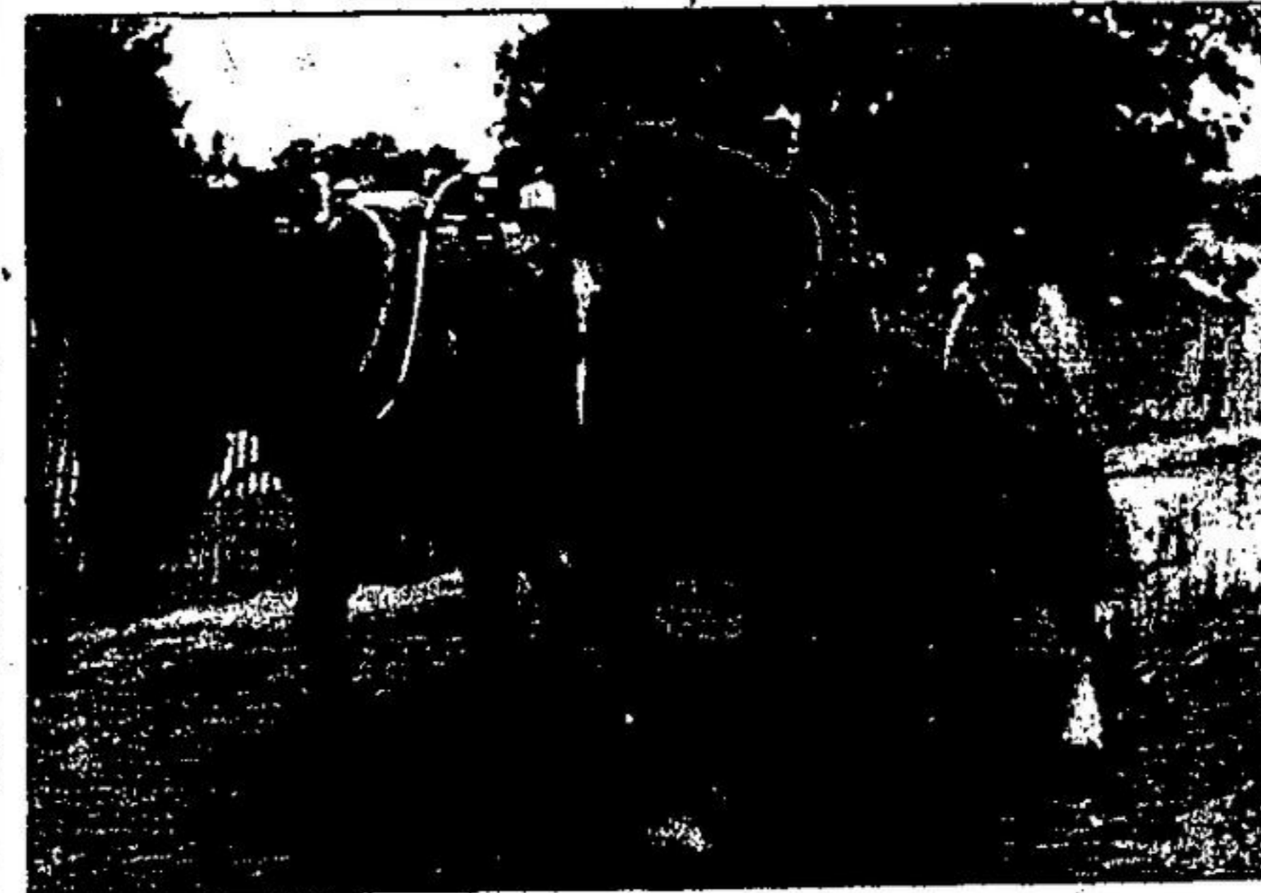
Heavy horses pull their weight.