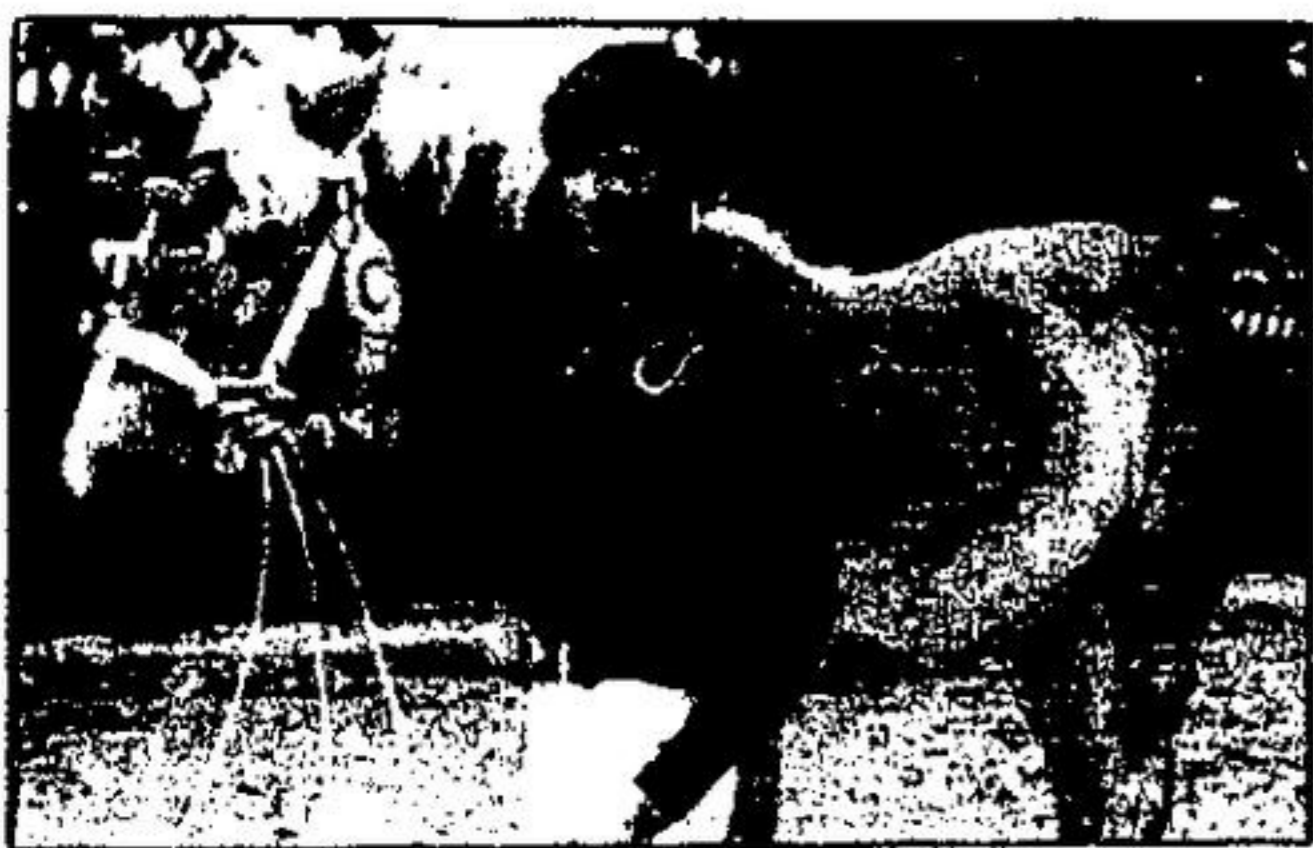
An Acton area resident placed third in the 1 to 2 year-old gelding class.