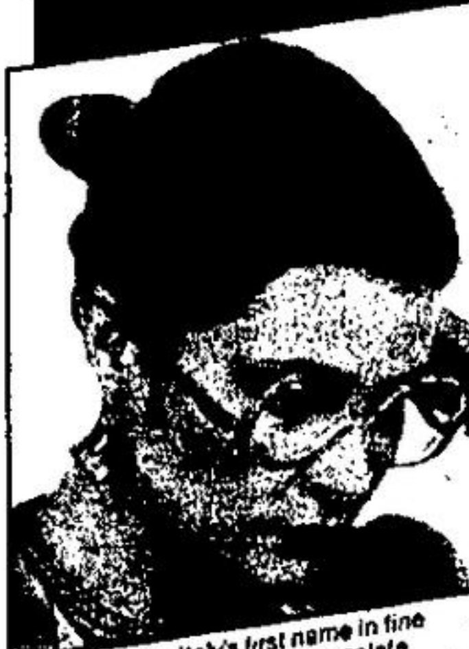
DA VINCI - Italy's first name in fine optical fashion. See our complete selection of quality European eyewear in our fashion showrooms.