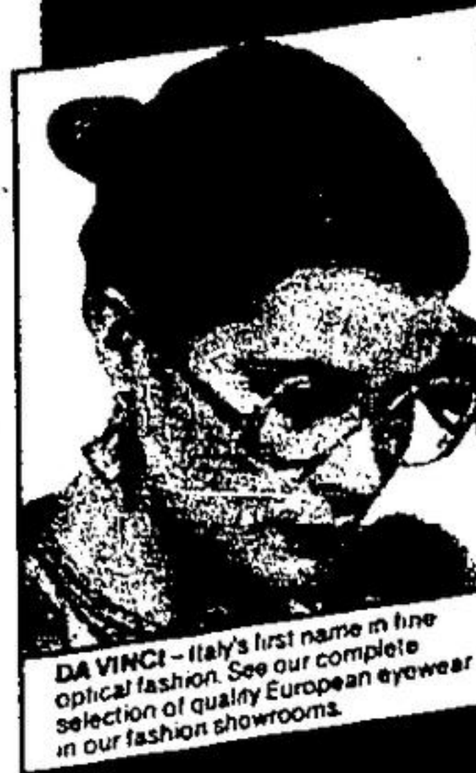
DA VINCI - Italy's first name in fine optical fashion. See our complete selection of quality European eyewear in our fashion showrooms.