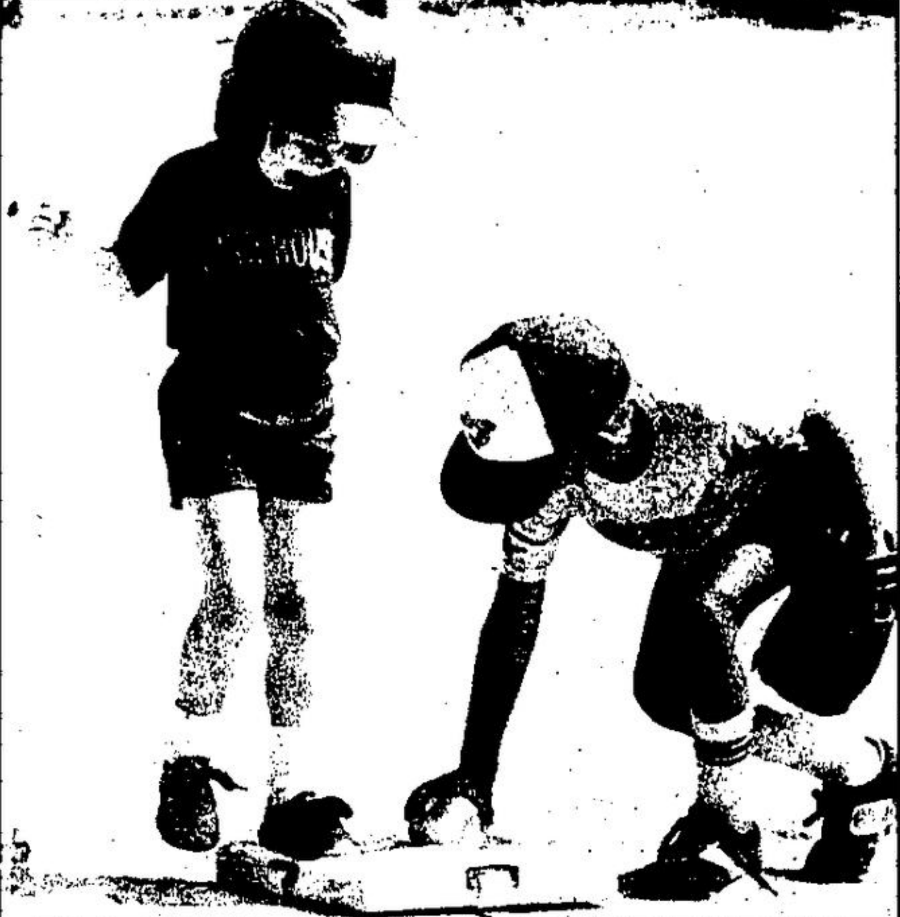
Safe or out? You be the umpire. Limehouse T-ballers had some fun on Sunday as their Minor Ball organization had their wind-up day and corn roast at the arena diamond. Teams played a little ball, picked up their awards for the season, and filled up on corn. T-ball players had a rare treat. They had the opportunity to hit without the aid of the tee.

find the back of the net, early in the game. From then on, it was simply another case of hard luck for the Leathertown squad. There will be no game for the team this weekend, but play will resume the following week, with a semi-final League Cup match.