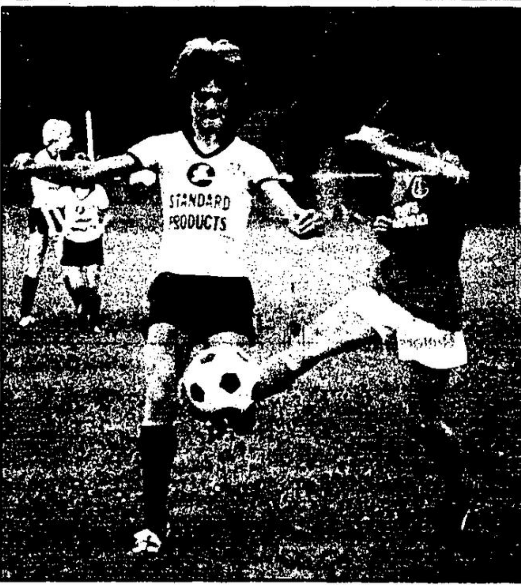
An Acton Standard Products player does battle with a Milton Syer's Flooring opponent in recent boy's Pee-Wee action. Acton won this one, 8-1.