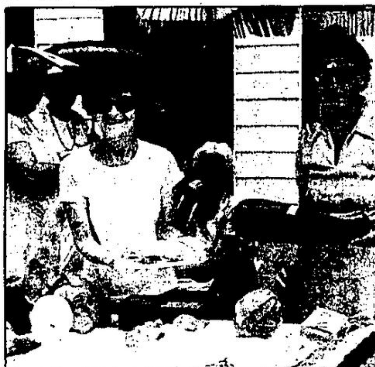
The Anglican Church Women sold a variety of goods, from vegetables to handcrafts.