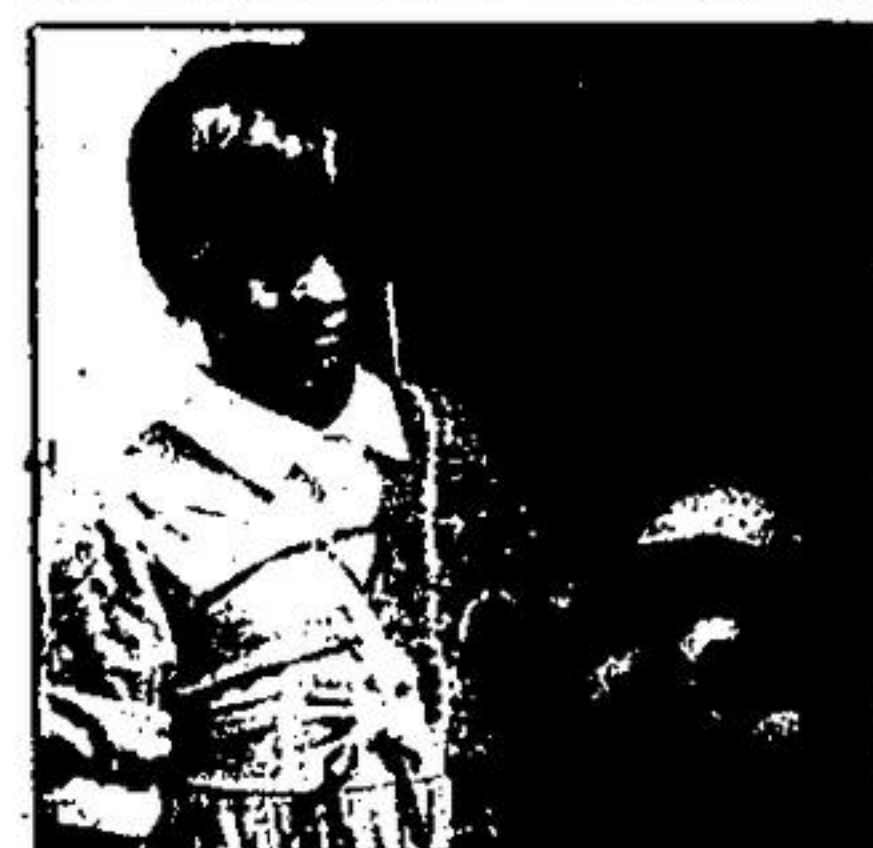
This little girl fell in love with a soft cuddly puppy which was for sale.