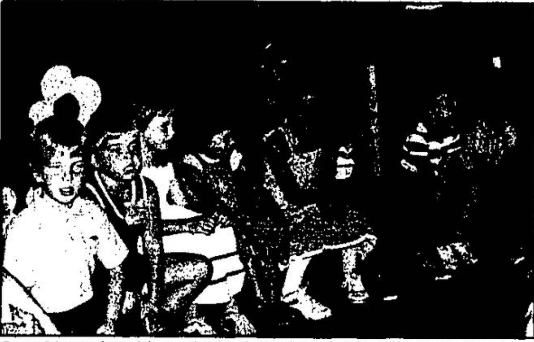
Some of the members of the Baptist Church Vacation Bible School close out a session with a song during exercises Wednesday morning.

A 36-year-old Kingham Rd. resident has been charged with aggravated assault after threatening his neighbor with a machete Friday evening, at about 10.50 p.m. Halton Police report that a man and his wife were sitting on their front steps when a neighbor approached them. The man confronted the neighbor on the steps and an argument ensued. The accused poked the man in the stomach with a machete, and the victim attempted to push the blade away from his body, receiving cuts to his index and middle fingers. The man was arrested shortly thereafter at his residence, police say.