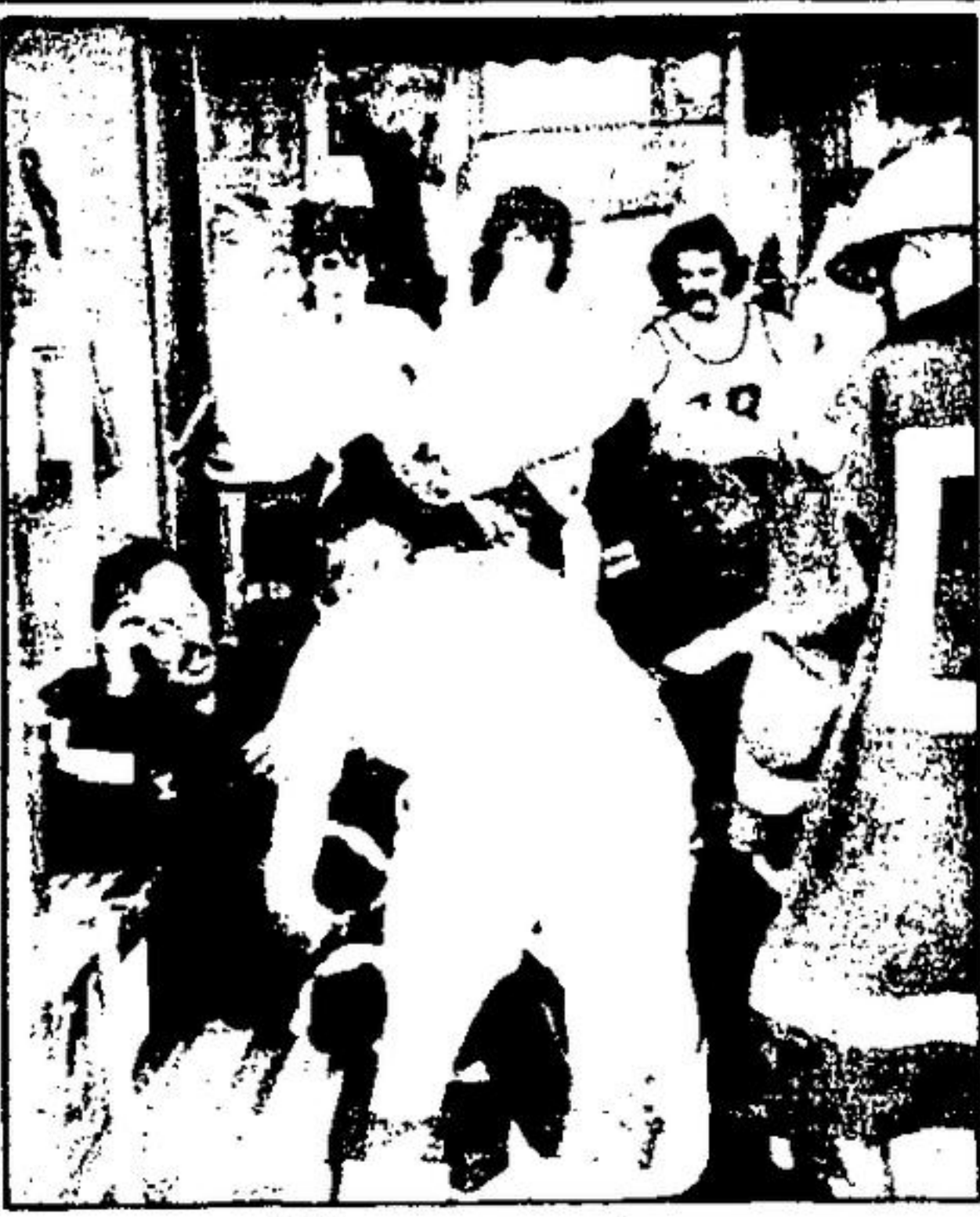
Fireworks explode early