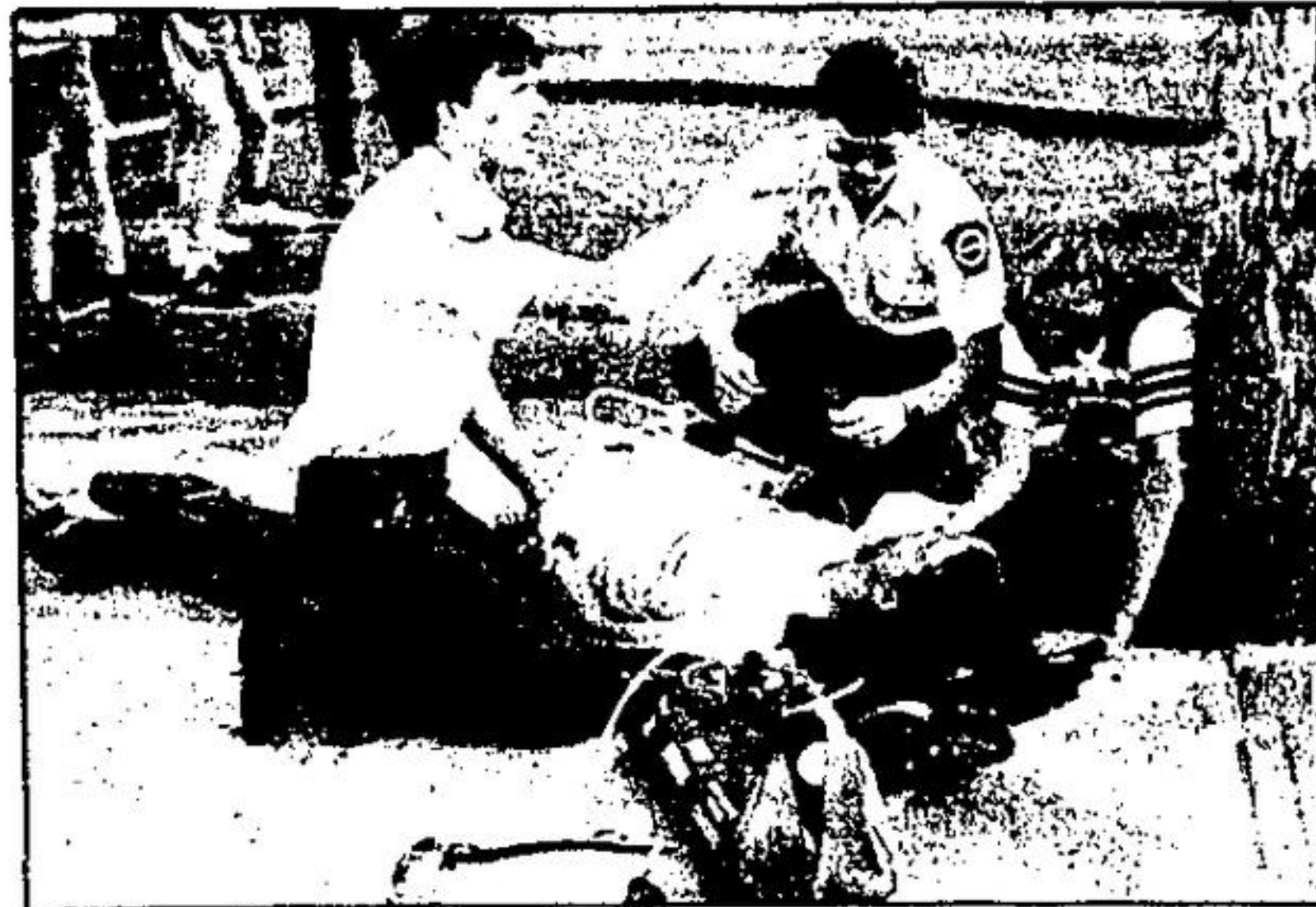
This week thru the lens