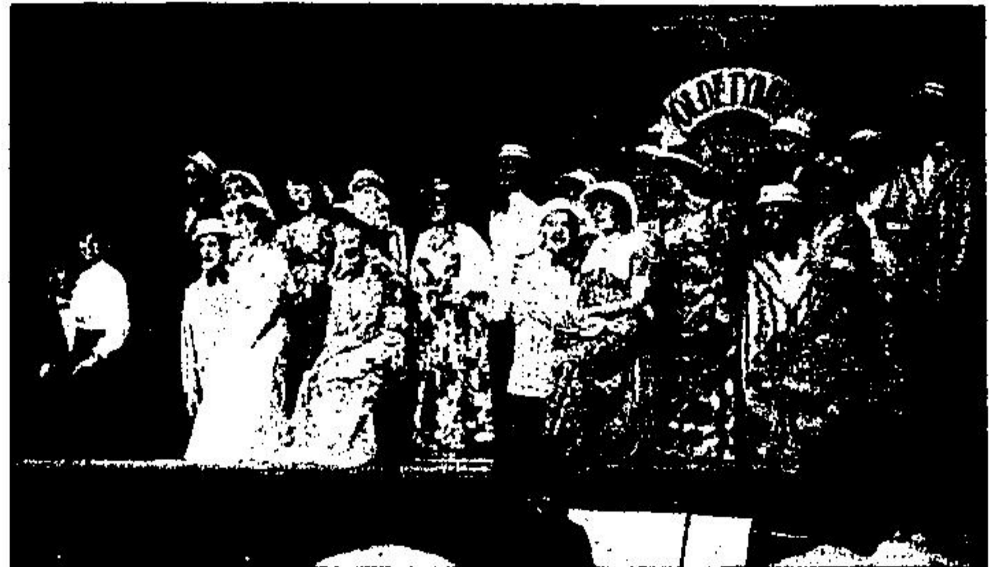
Nothing like an old tyme concert.