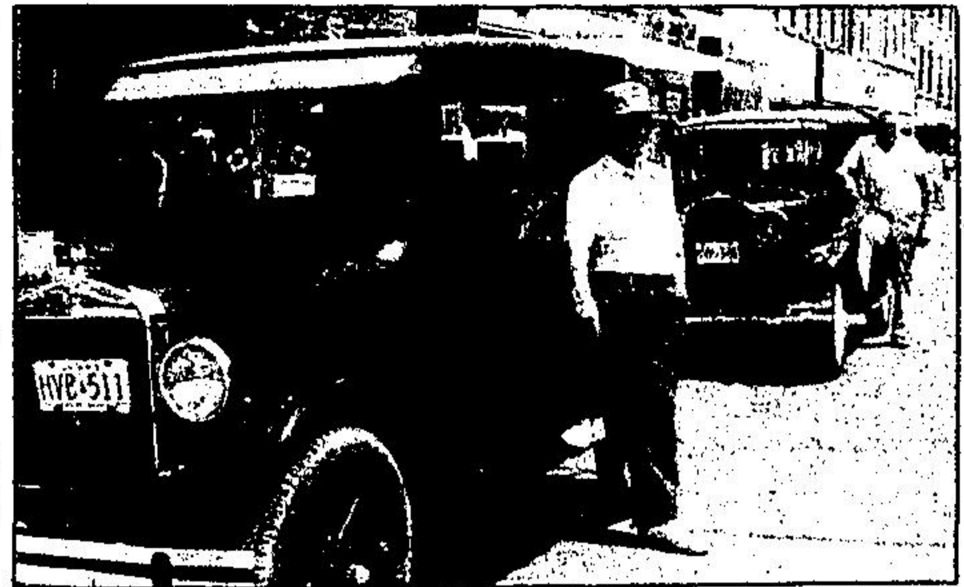
Vintage cars such as these are a feature of Pioneer Days.