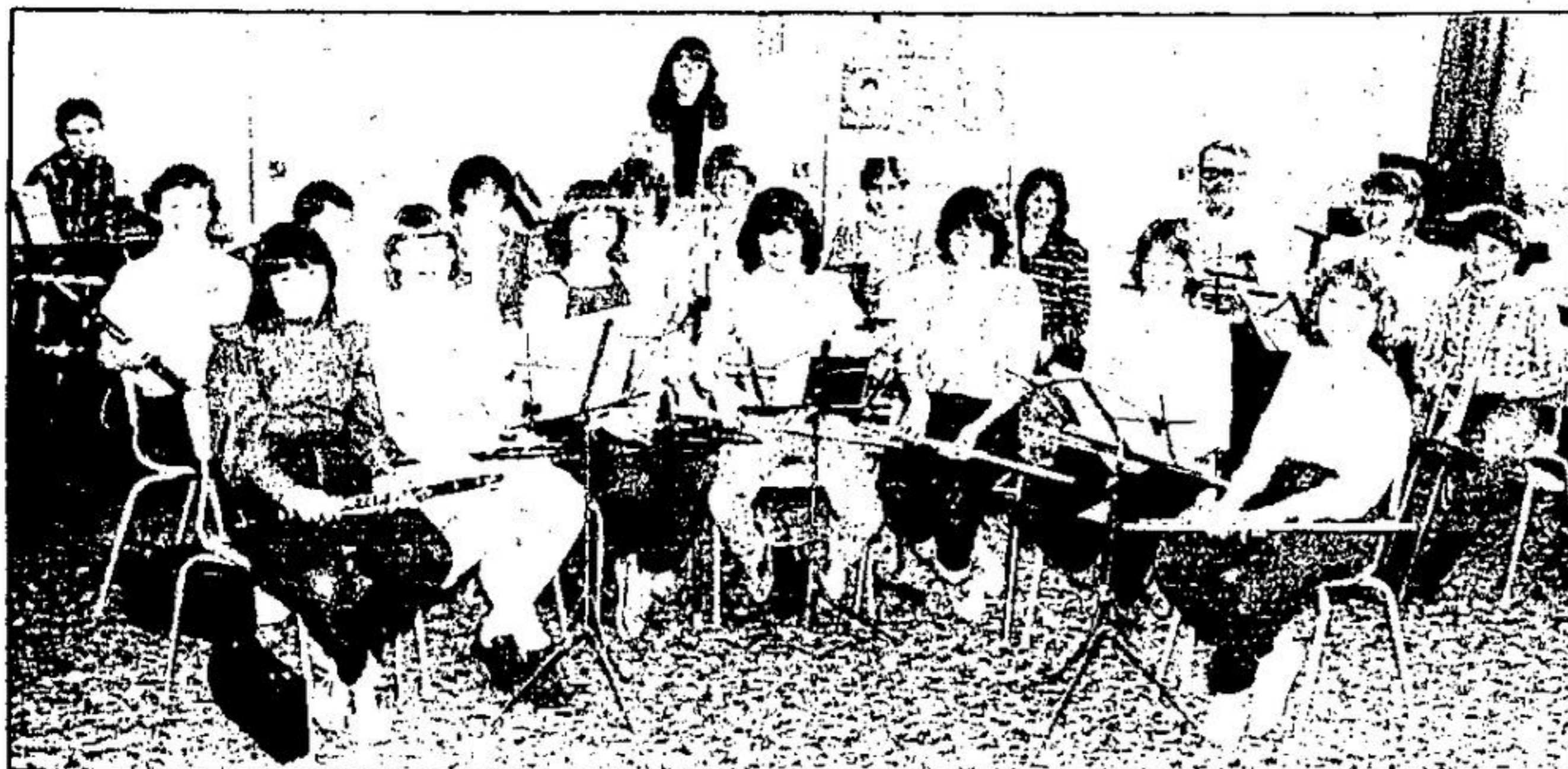
The McKenzie-Smith band was a feature at the school's variety night on Thursday. There's a story on the show and more photos on page 3.