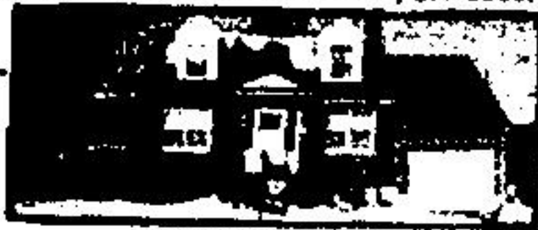
CAPE COD STYLE

The estate would like to see an offer. Immediate possession. Bright living room with adjoining dining room area. Eat-in kitchen and 3 bedrooms. The basement has fully finished bathroom, living room, kitchen and bedroom. Asking price $83,900. Call Pearl Kerby 877-9500. 70-10