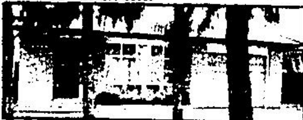
IN THE GLEN

3 or 4 bedroom brick house. Large kitchen with separate dining room, beautiful living room, guest room with powder room, sun room, 1 1/2 car garage and beautiful large lot all for the price of $73,900. For more information call Ila Switzer 877-9500. 70-21