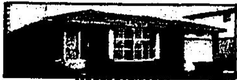
MOORE PARK AREA

Canada Trust Realtor 29 MAIN ST. S., GEORGETOWN 877-9500 . . . . . TOR. LINE 453-2900