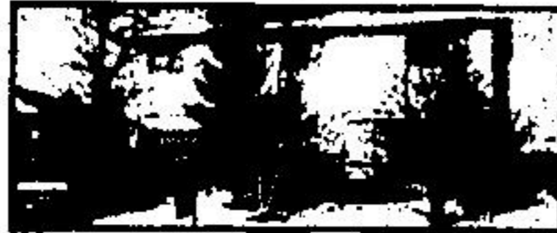
GREAT FAMILY HOME

Beautiful 3 bedroom backsplit. A full basement and beautiful large lot. Under 10 years old. Priced to sell $92,500. 877-9500. 70-22