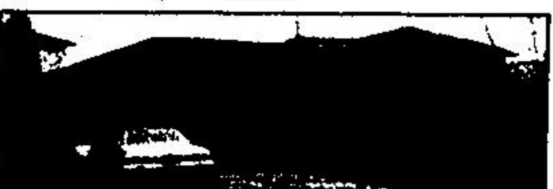
IT'S A DANDY

The interior of this spacious home has been tastefully remodelled to retain its old charm and character. Centrally located close to schools and shops it features a family sized kitchen, living room, dining room, 3 bedrooms, den or 4th bedroom, quality broadroom and garage. A must to see at only $48,900.