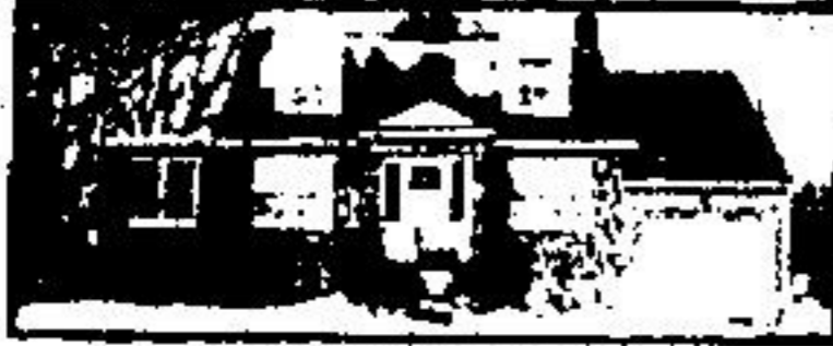
CAPE COD STYLE

The estate would like to see an offer. Immediate possession. Bright living room with adjoining dining room area. Eat-in kitchen and 3 bedrooms. The basement has fully finished bathroom, living room, kitchen and bedroom. Asking price $83,900. Call Pearl Kerby 877-9500. 70-10