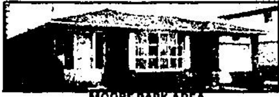
MOORE PARK AREA

Canada Trust Realtor 29 MAIN ST. S., GEORGETOWN 877-9500 . . . . . TOR. LINE 453-2900