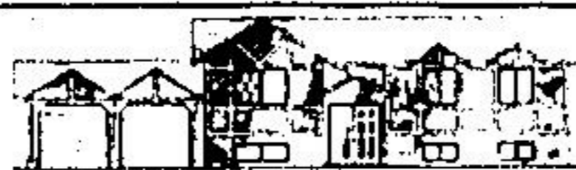
NEW HOME VALUE YOU WON'T BELIEVE!

A classic home from the turn of the century. Gracious, large home on Erin's main street with many trees. Some beautiful improvements. Canadiana lovers - Don't miss this one at only $68,900. Call for an inspection.