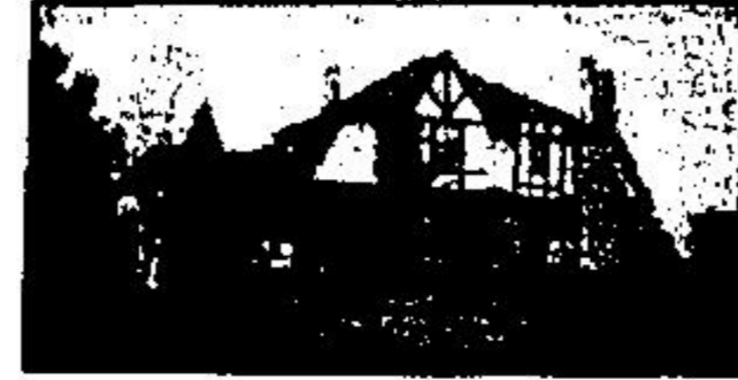
ESTATE HOME OF DISTINCTION

Tough to beat the value. $60 sq. ft. mobile home in Stanley Park. Three bedrooms, kitchen and living room. Compare anywhere at $22,900. Call Erin 833-9377.