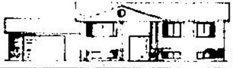
ERIN ACREAGE CATALOGUE

Value, comfort and quality for your family. Three bedrooms, two full baths, family room with fireplace and double garage. On big village lots in Hillsburgh. Net price $63,900. Reserve your lot and pick your finish by calling 877-8817.