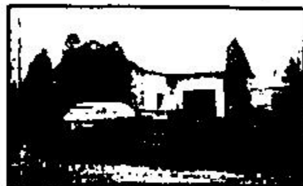
VENDOR WANTS TO MOVE TO COUNTRY

5 acres, nicely treed, ready to build. For details call Pearl Kerby 877-9500. 70-06