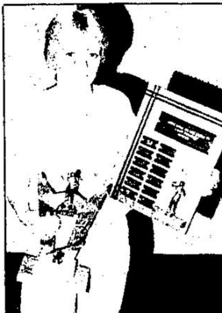
Barbara Leech captured the ladies' dart singles crown.