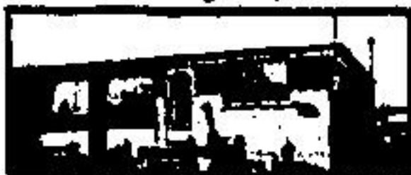
BRICK-3 BEDROOM -$63,500

with 5 bedrooms, 3 washrooms on treed lot in Georgetown. Terrific buy at $81,900. Call Reg Cooper 877-9500. 70-20