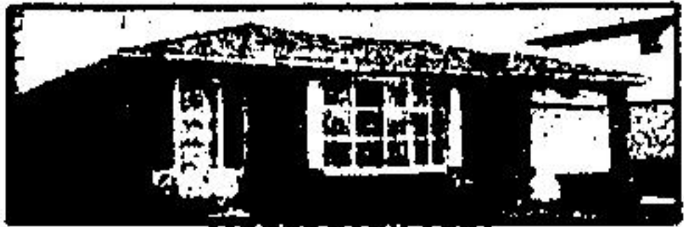
MOORE PARK AREA

Canada Trust Real Estate 29 MAIN ST. S. GEORGETOWN 877-9500 ... TOR. 453-2900