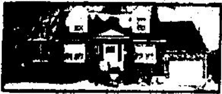
CAPE COD STYLE

The estate would like to see an offer. Immediate possession. Bright living room with adjoining dining room area. Eat-in kitchen and 3 bedrooms. The basement has fully finished bathroom, living room, kitchen and bedroom. Asking price $83,900. Call Pearl Kerby 877-9500. 70-10