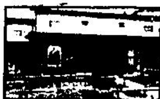
LOW DOWN PAYMENT

130 seat restaurant fully equipped and operating presently grossing approximately $300,000. Excellent lease with 4 years remaining plus option of renewal. Good location offering ample parking. This is a going concern with tremendous potential. Would make an ideal family business. For details call 877-9500.