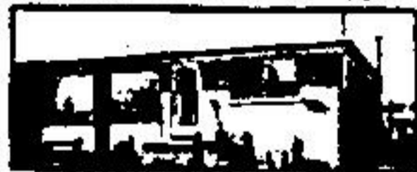
BRICK-3 BEDROOM - $63,500

Why rent when you can purchase a detached home for $56,500. Full basement with a second bathroom. The yard is partly fenced with plenty of room for a good garden. Want to see it? Call Ila Switzer 877-9500. 70-11