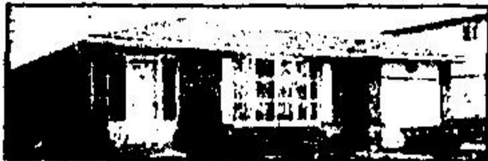
MOORE PARK AREA

Beautiful 3 bedroom backsplitted. A full basement and beautiful large lot. Under 10 years old. Priced to sell $92,500. 877-9500. 70-22