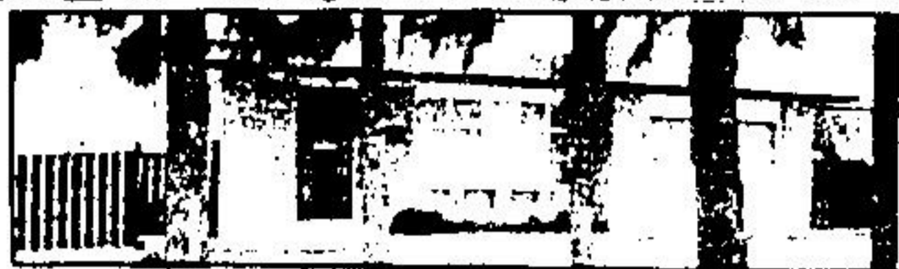
IN THE GLEN

Canada Trust Realtor 29 MAIN ST. S., GEORGETOWN 877-9500 . . . . . TOR. LINE 453-2900