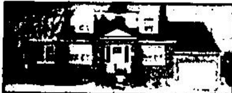
CAPE COD STYLE

with 5 bedrooms, 3 washrooms on treed lot in Georgetown. Terrific buy at $81,900. Call Reg Cooper 877-9500. 70-20