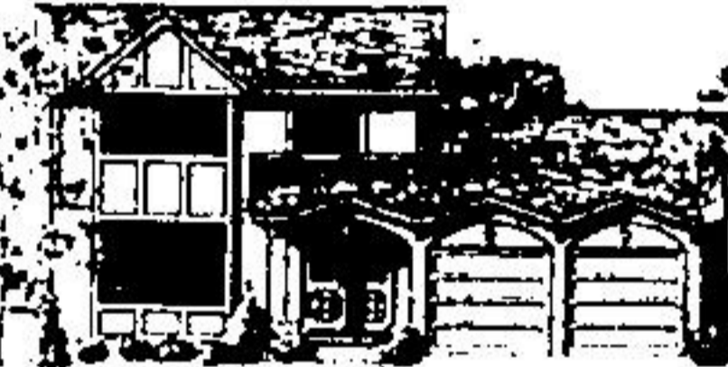
SO MISS OUT!

Large enough to "Do Your Thing" but small enough to manage easily. Pretty setting of timber and stream on almost two acres. An all steel 40' x 30' shop or barn. Home finished top to bottom. Easy to buy at $108,900. Call Ruth Clement - 877-8317.