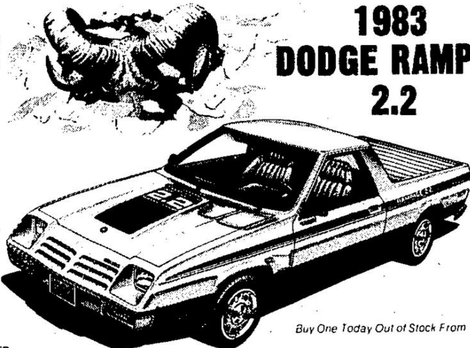
Buy One Today Out of Stock From

*LOCAL TAXES & TRANSPORTATION NOT INCLUDED.