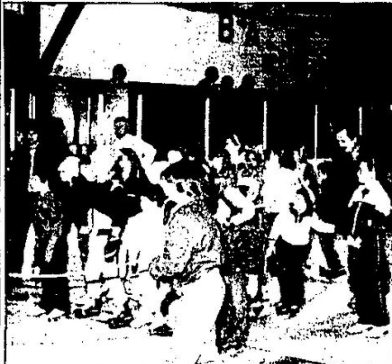
The St. Joseph's and M.Z. Bennett pupils gather to hear instructions from Rotary members before starting their skate.

Skate-a-thon raises $10,000 This week thru the lens