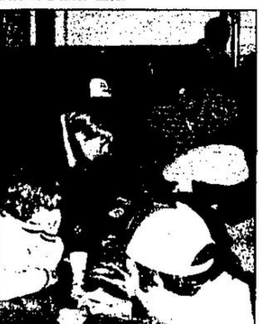
Acton Rotary Club members were busy Sunday afternoon registering pupils taking part in the annual skate-a-thon.