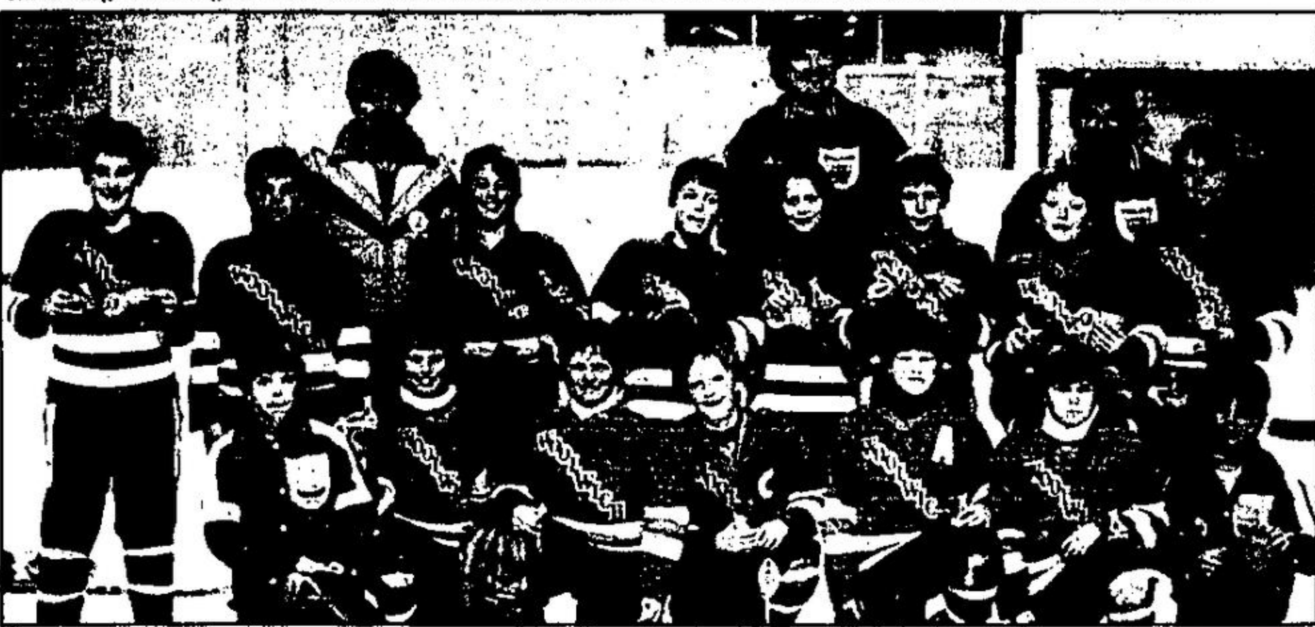
Elmira beat Hespeler 6-1 in the consolation finals of the Acton Centennial Atom Tournament at the Acton Community Centre last weekend to win the Hockey Moms Trophy.