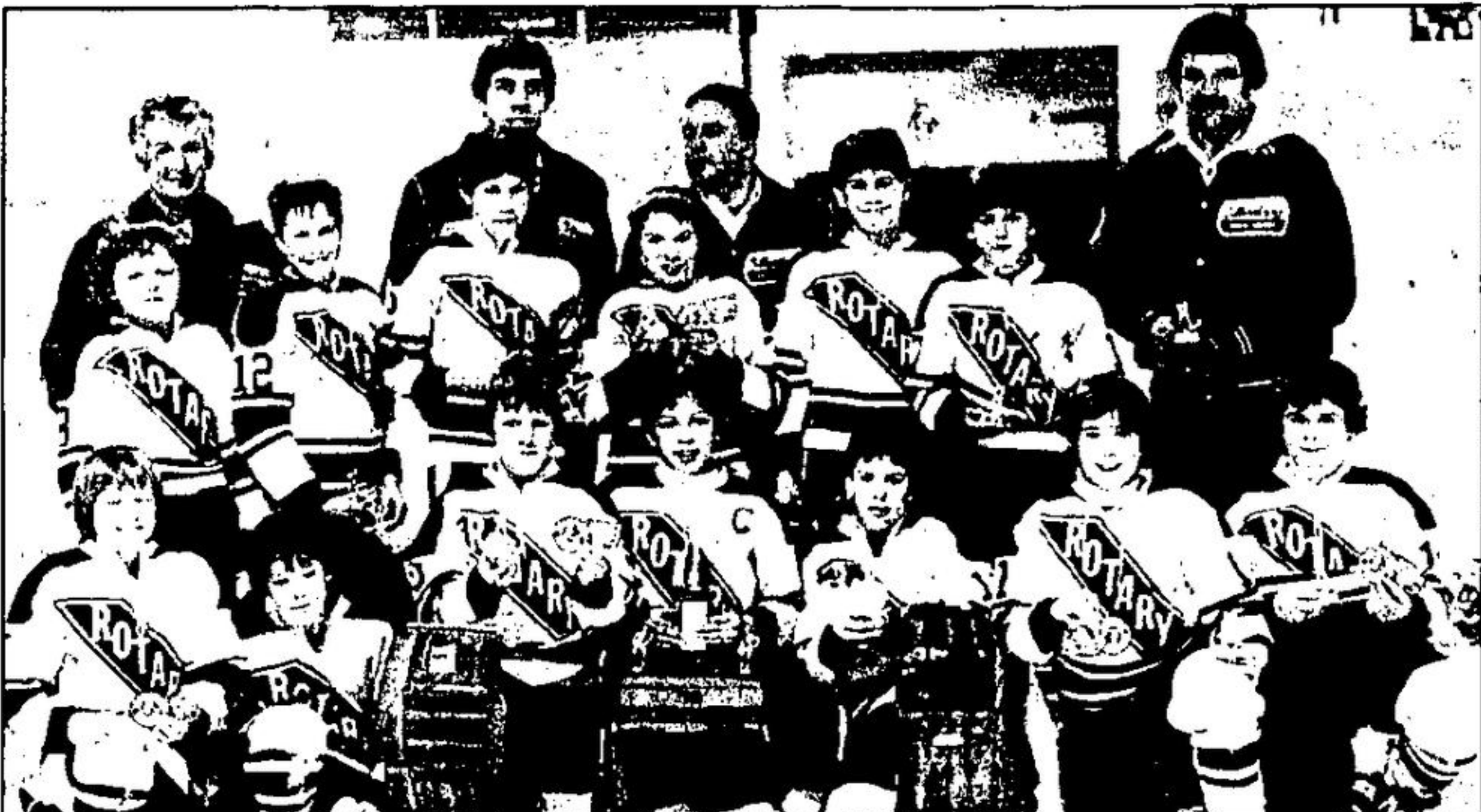
Tillsonburg beat Orangeville 2-1 in the finals of the Acton Centennial Atom Tournament Sunday at the Acton Community Centre.