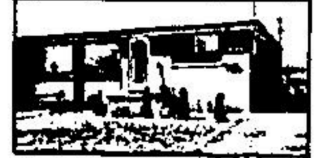
BRICK-3 BEDROOM - $63,500

$41,900 buys you your own home. Eat-in kitchen, large living room and walkout to sun deck. Beautiful rec room with bar and 3 bedrooms. Want to see it. Call Ila Switzer for appoint. 877-9500. 70-13