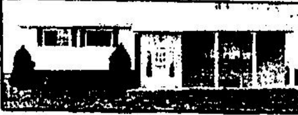
QUALITY & STYLE

Modern 3 bedroom bungalow, attached garage. Self-contained in-law suite down. Close to school & shopping. Asking $84,900. For more information ask for Pearl Kerby 877-9500. 70-10