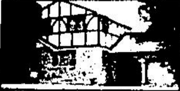
COUNTRY WITH A DIFFERENCE

Open concept. Large, bright living room with fireplace. 3 bedroom, brick and aluminum. Three walkouts to cedar deck, large sunroom. Five minutes to Go train and downtown Georgetown. 1/2 acre lot. Asking $119,900. For appointment call Ila Switzer 877-9500. 70-12