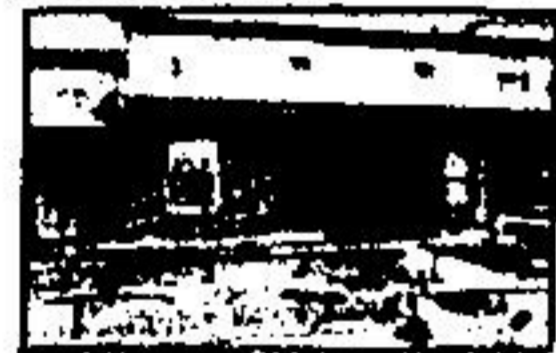
FIRST TIME BUYERS

Start off with this conveniently located detached bungalow with 2 or 3 bedrooms. Well maintained inside and out. Realistically priced at $59,500. Call Ila Switzer at 877-9500. 70-11