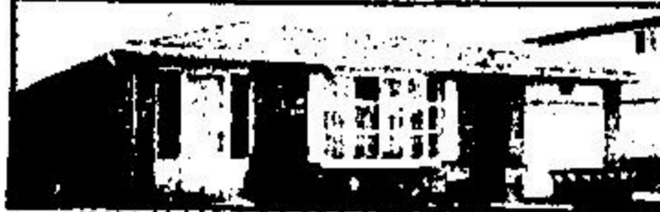
IMMEDIATE OCCUPANCY AVAILABLE!

Lovely garden soil acre south of Georgetown. With spacious brick bungalow. Sun room, walkout, garage. Asking $91,900. Owners have bought, hurry! Call Reg. Cooper. 70-15