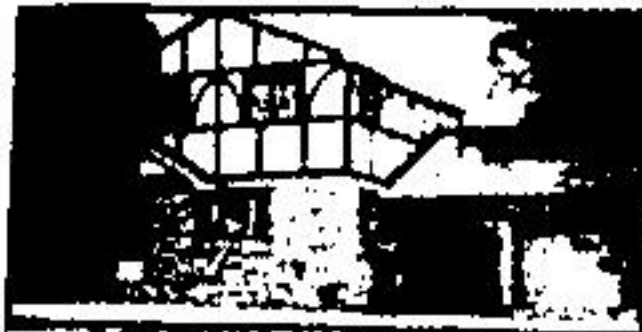
COUNTRY WITH A DIFFERENCE

Open concept. Large, bright living room with fireplace. 3 bedroom, brick and aluminum. Three walkouts to cedar deck, large sunroom. Five minutes to Go train and downtown Georgetown. 1/2 acre lot. Asking $119,900. For appointment call Ila Switzer 877-9500. 70-12