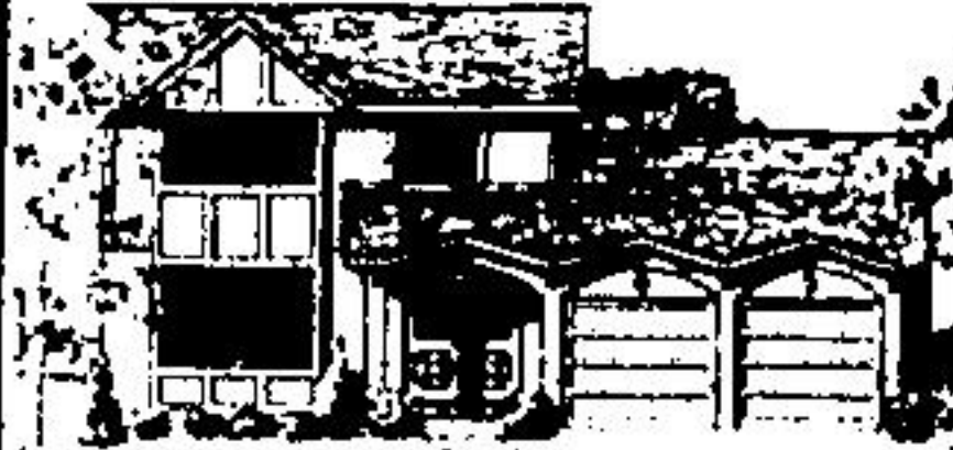
NEW! NEW! NEW!

Come see the model home on 230 ft. lot in Erin. Features. Style. Quality. Compare at $78,900. $1,000 grants still apply.