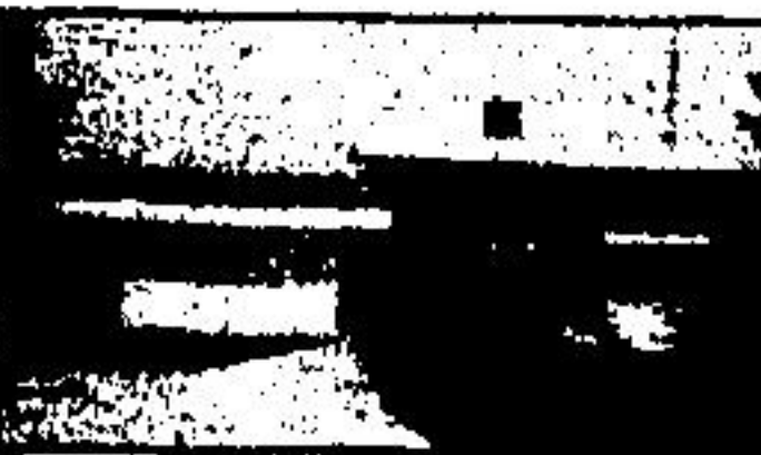
IMMACULATE ON 1 ACRE in Rockwood area and owner will hold a mortgage.

10 acres with 9 stall horse barn - all buildings 4 years old - Rockwood.