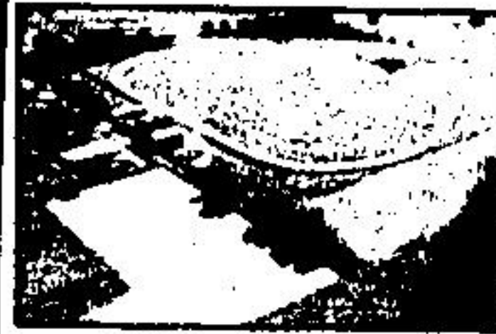
ON 57 ACRES IN ROCKWOOD

Crown City Realty Limited Realtor Member Broker