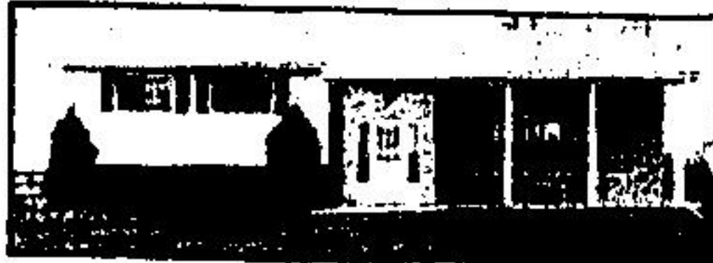
QUALITY & STYLE

Self contained in-law suite. Three bedroom detached bungalow close to schools and shopping. Asking $84,900. Call Pearl Kirby for information 877-9500. 70-10