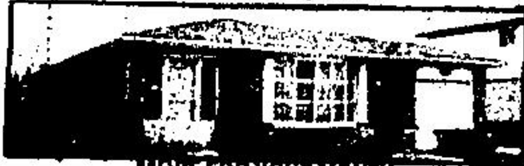
MORE FOR YOUR MONEY

Great value bungalow with family room and wood burning stove, fenced yard and paved drive. Hurry and call Reg Cooper. 70-14