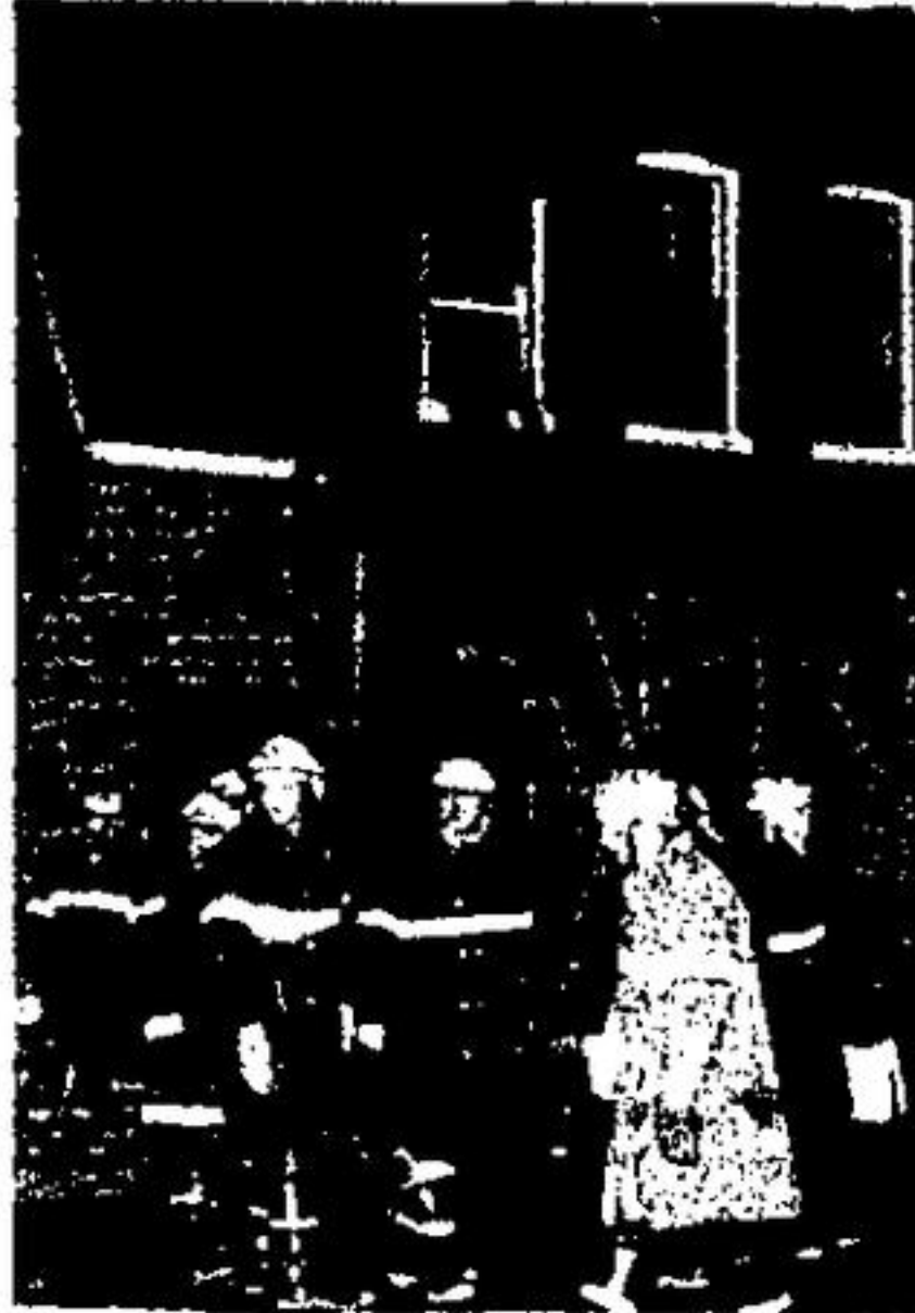
Firefighters were called to a Mill St. apartment early Monday morning because of a smoldering TV.

carry the television down the stairs and outside, but could not go through the door. Police broke through the locked door and extinguished the fire.