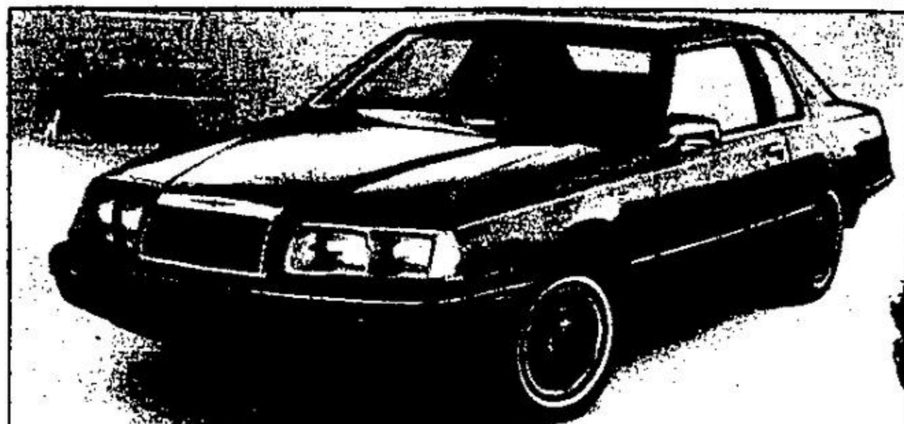
The 1983 Thunderbird is the first example of Ford's giant leap forward in applying aerodynamics to automotive design. Extensive aerodynamic testing in designing the new Thunderbird has given it the lowest air-drag co-efficient among domestic competitors in its class. The new Thunderbird is powered by a Windsor-built 3.8-litre V-6 engine. An optional 2.3-litre EFI-Turbo OHC engine with a five-speed transmission will be introduced later.