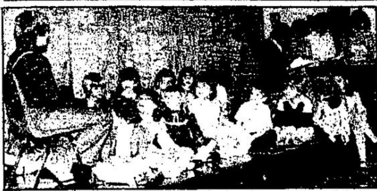
St. Alban's Anglican Church Sunday School students put on a Christmas Concert Sunday in the Parish Hall.